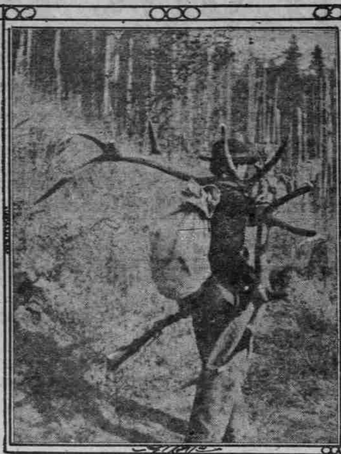
ELK KILLED IN COOS COUNTY.