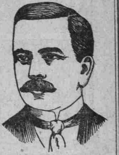
THE MASTER SPECIALIST. Why waste money "trying" different doctors? Go to the Master Specialist in the first place and get cured and avoid experimenting with poor doctors.

Don't take chances with "patent medicines" or "tips from friends" and run the risk of dangerous complications. But in the quickest care in the world. Don't wait until something happens. Call in the beginning and save money. We will charge only a few dollars for the first treatment, provided you call early.