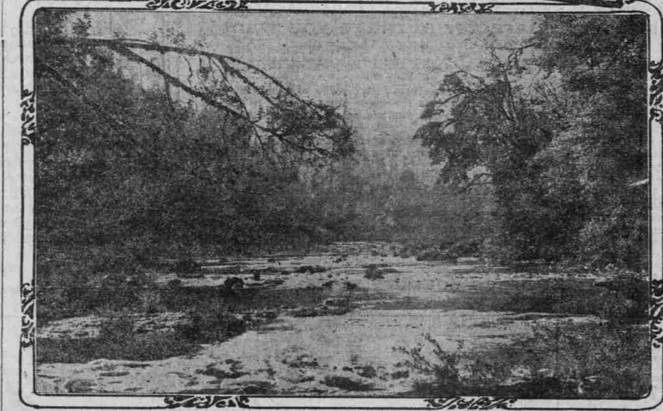
TROUT FISHING PLACE ON UPPER COOS RIVER.