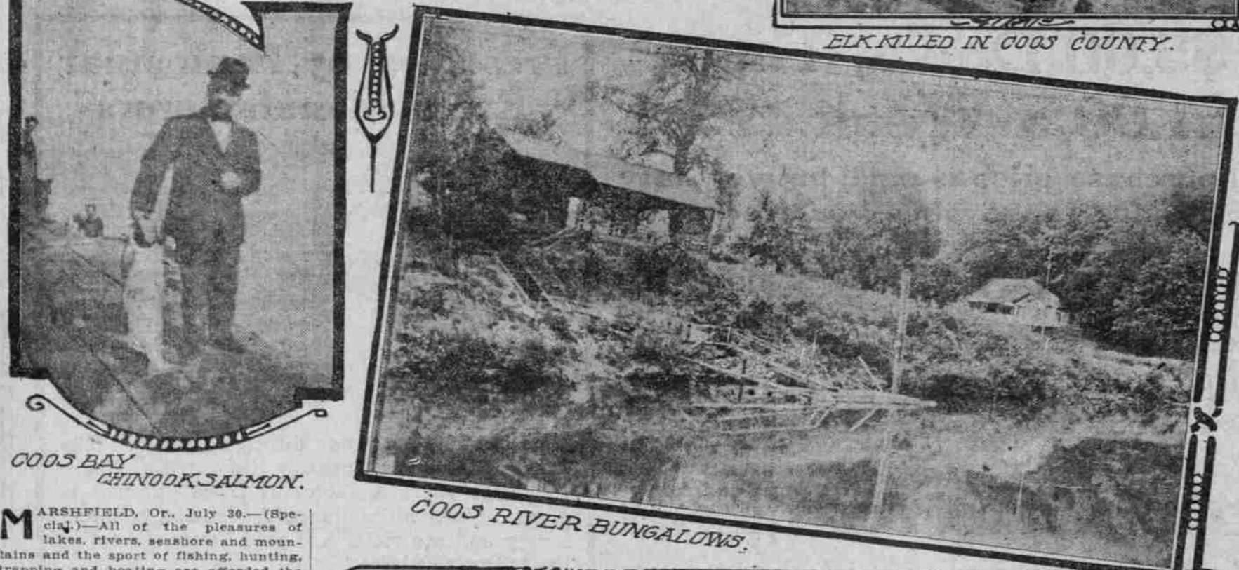
COOS RIVER BUNGALOWS.