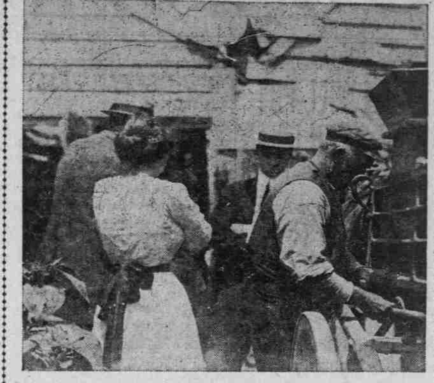
FATHER OF MRS. CRIPPEN, AT HIS TRADE OF WAGON MAKING.

RELATIVES OF SLAIN MRS. CRIPPEN, WHO URGE PROSECUTION OF HER SLAYER.