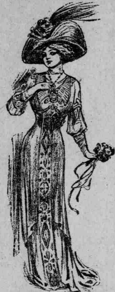
One of handsome Shantung, in natural color; very heavily embroidered, panel front; was $110.00, now $69.50

One of handsome white chiffon over silk messaline, very effectively draped; was $125.00, now $79.50 One of smoke brown marquisette over satin, with rhinestone trimming, wide satin flounce; was $135.00, now $79.50 One of pale gray crepe meteor, handsomely draped; was $135.00, now $79.50 One of black chiffon crepe, with cut jet trimming; was $150.00, now $79.50 One of beautiful black chiffon crepe over old blue heavy satin; was $169.00, now $89.50 One of gold messaline with overdress of black chantilly lace, was $195, $97.50 Another beautiful black marquisette over turquoise blue; $215, now $107.50 One of gorgeous black marquisette, with a beautiful pattern woven of iridescent jet; was $275.00, now $137.50