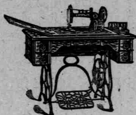
Supreme, Model M Price $16.00

Demonstration will be held on the Main Floor. Free instruction will be given at home to purchasers of any model of the Supreme Machines.