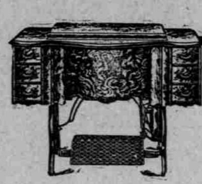
Supreme, Model D Price $35.00

Supreme, Model H, $23.75—A standard five-drawer Machine, the workwood being of quarter-sawn golden oak and beautifully finished. All workwood is on the built-up principle and absolutely cannot warp, split or check. Has drop-head, is ball-bearing in both belt wheel and pitman and has all the attachments.