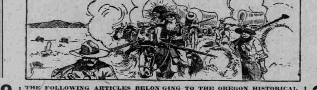
THE FOLLOWING ARTICLES BELONGING TO THE OREGON HISTORICAL SOCIETY HAVE BEEN LOANED TO THE MEIER & FRANK STORE AND ARE ON EXHIBITION IN THEIR FIFTH-STREET WINDOW.

In appreciation of the loyal and steadfast support accorded this store by its army of Pioneer patrons, we desire to acknowledge and honor this long, unbroken friendship, and have selected the week of June 20 to 25 to be known as pioneer week, to be celebrated in conjunction with our 54th Anniversary and 54 Days Wonder Sales. We particularly invite all old friends of the store to be with us on this occasion, included among whom are many who were personally acquainted with the founder of this business, and to make this store their headquarters during the festivities especially prepared for Pioneer Week. We shall be delighted to conduct you through the store and point out the wonderful and improved methods now adopted in conducting this business as against those in use in 1857. Anniversary Souvenir Booklets containing photographs of the four different buildings occupied by Meier & Frank Company since its establishment are now being distributed to all patrons and will be of unusual interest to Portland pioneers. Be sure to ask for one. Announcements of exceptional bargains for Pioneer Week are printed elsewhere on this page. Your attendance cordially urged. Welcome.