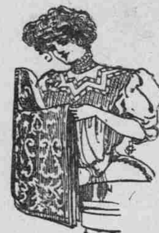
Table Cloths, Once a Year at $1.95

—Once a year in return for our heavy orders this manufacturer reserves for us his surplus table cloths.