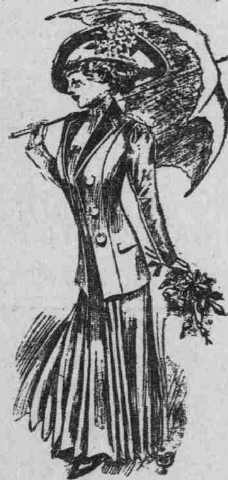
Other models in many different fabrics, both plainly tailored and trim'd, range in price from $60 to $100.

Among the new arrivals are the Debutante Dresses—in the very prettiest and daintiest of materials—printed chiffon, mulls, hand-embroidered linen and lingerie.