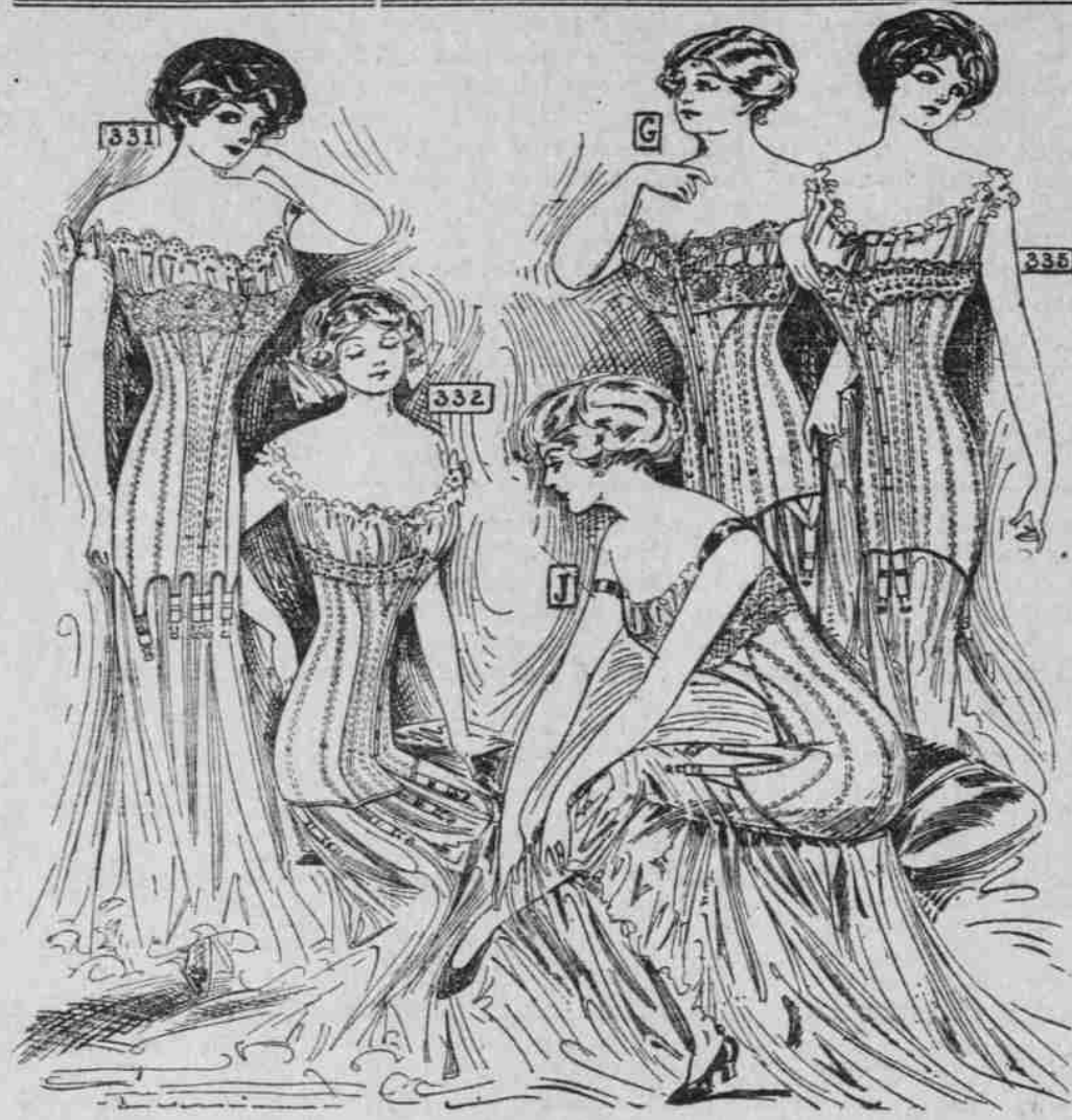
Model 332—for the slender, petite figures and young girls. A lightly-boned, flexible corset. Girdle top, yet long enough over hips and abdomen to prevent lines from showing—$5.

Corsets either mar or enhance the beauty of a woman's gown. No other element plays such an important part in the general scheme of dress. One defect or artistic feature strikes a false chord and spoils the whole symphony.