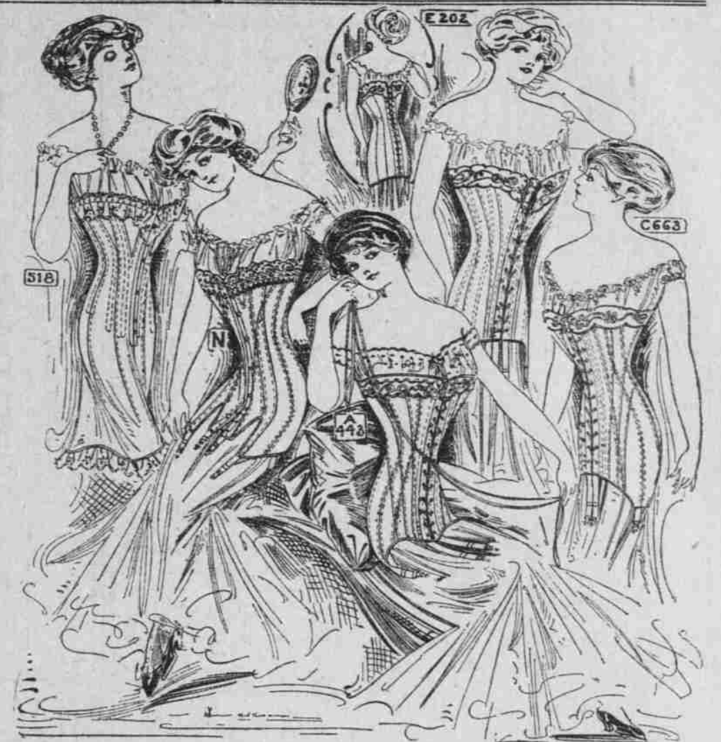
Model 335—A corset for the average figure, with medium low bust. Is extremely long over hips and abdomen. Made of French coutil and trimmed with embroidery and ribbon beading—$5.

Model A 413 is front-laced and an excellent corset for the average slight figure. Has medium bust and long hip. Made of imported batiste—$5.