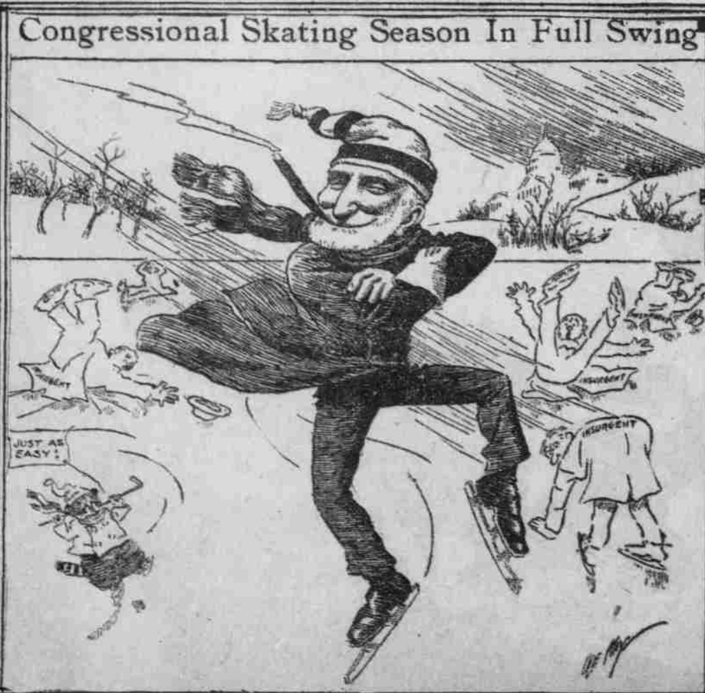
SPRINGFIELD GAZETTE TIMES