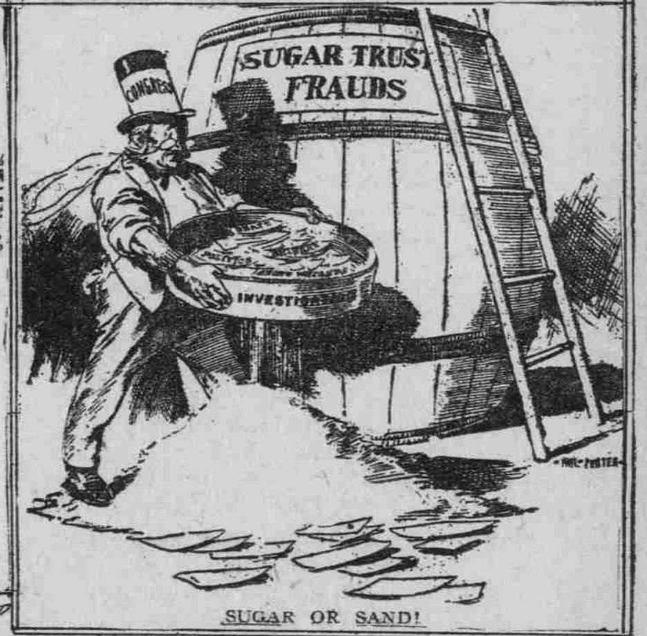
NEW ORLEANS TIMES DEMOCRAT