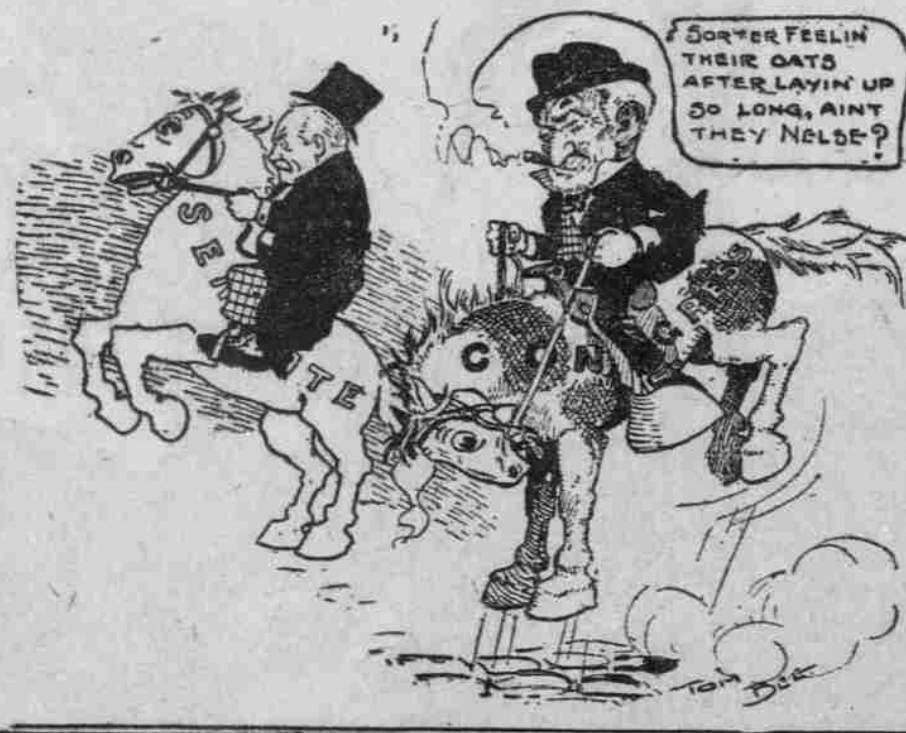
CLEVELAND PLAIN DEALER