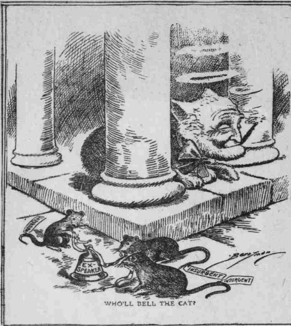
WASHINGTON EVENING STAR