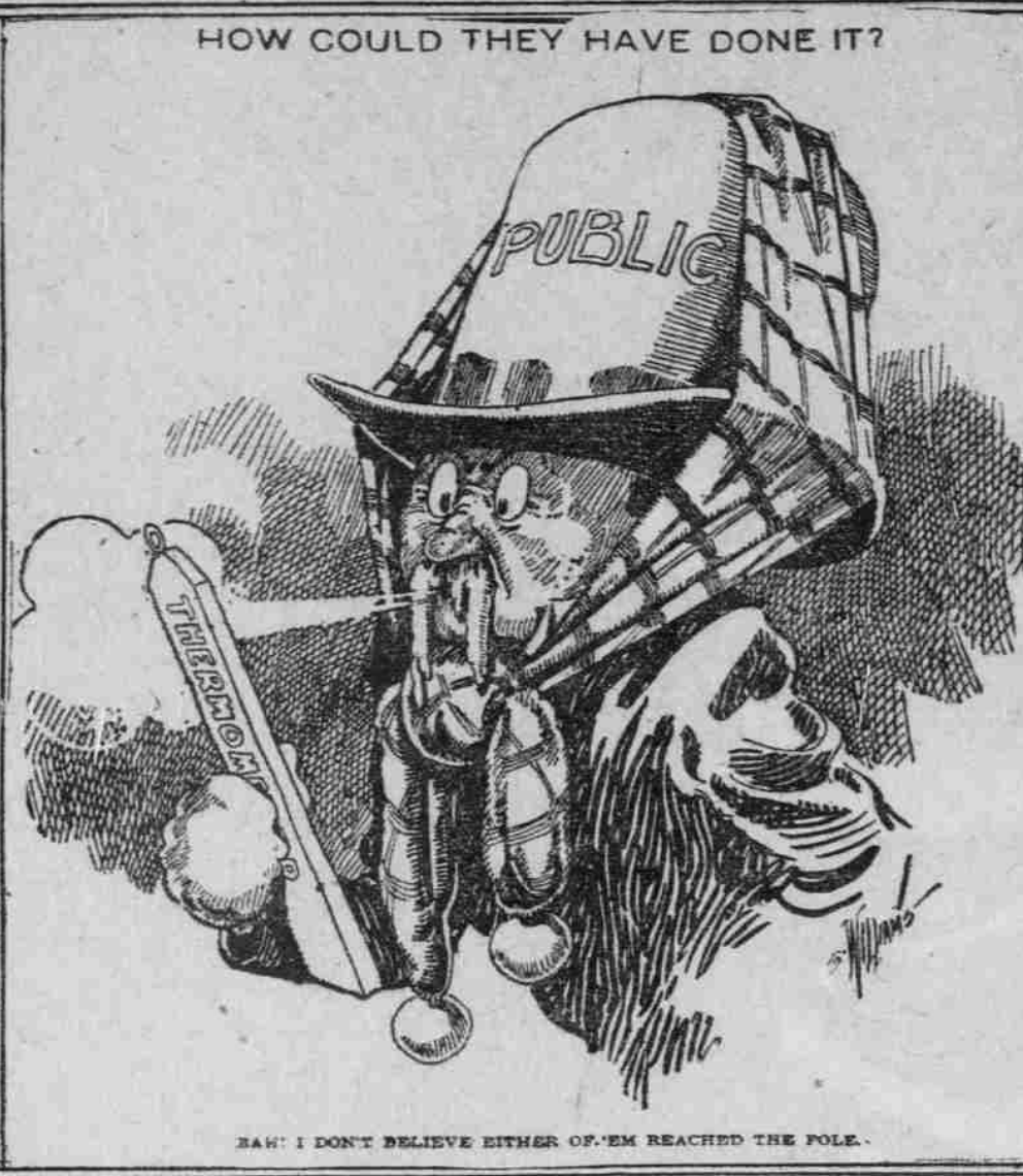
BAH! I DON'T BELIEVE EITHER OF 'EM REACHED THE POLE.