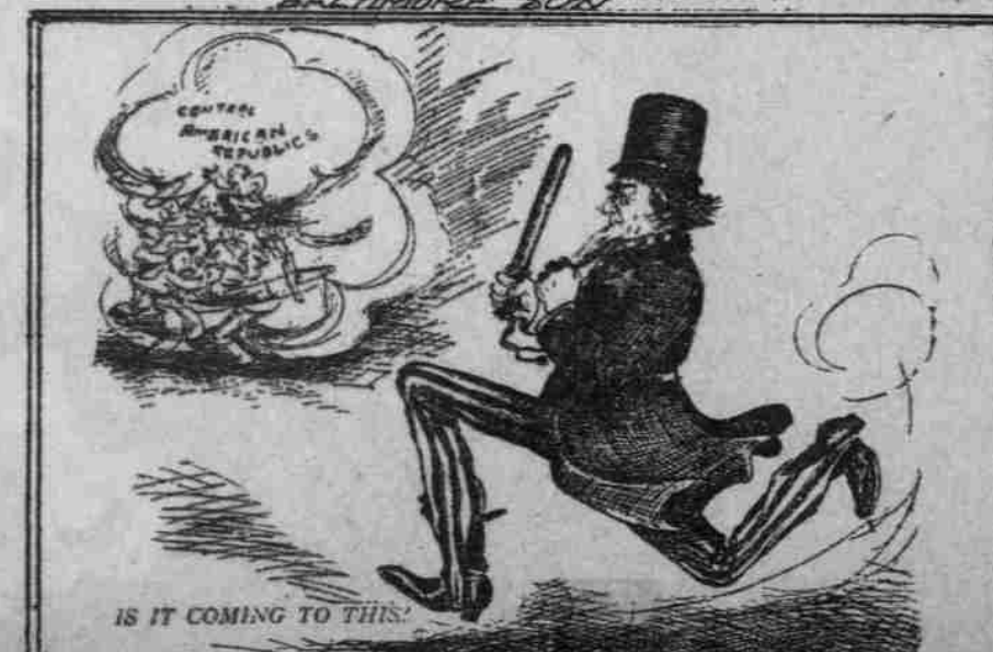
SALT LAKE TRIBUNE