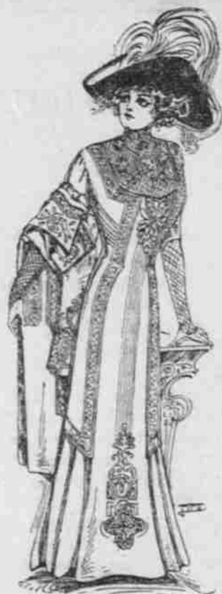
New dresses for misses and debutantes—just received—for dinner or evening wear. Charming styles and many pretty, dainty materials. $35.00 to $100.00

THE SERVICE OF OUR TEA ROOM IS MOST POPULAR FOR MID-DAY LUNCH and AFTERNOON TEA—EVERYTHING PREPARED IN OUR OWN KITCHEN