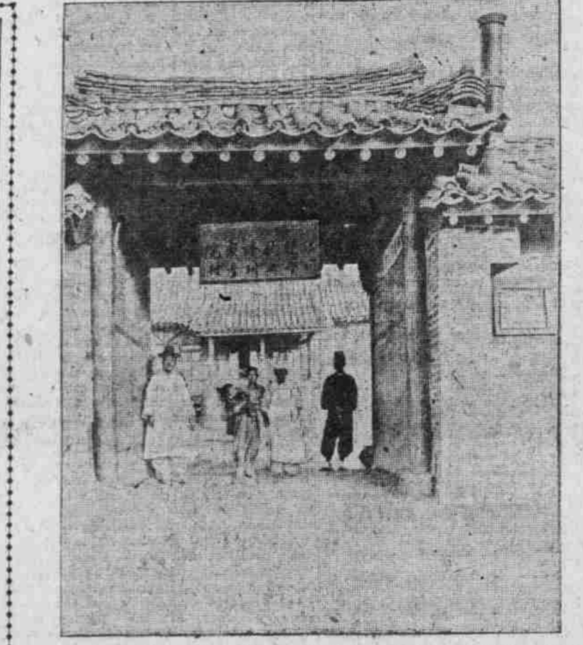
ENTRANCE TO CAROLINE A. LADD HOSPITAL, PYONG YANG, COREA.

Wedding and visiting cards. W. G. Smith & Co., Washington bldg., 4th and Wash. Something Everybody Should Know. Any one suffering from rheumatism, lumbago, kidney or bladder trouble and backache can get quick relief by procuring from his druggist the following simple remedy: Two ounces of olive oil, mixed with four ounces pure olive oil, and taken in two-teaspoonful doses every three hours. This remedy contains absolutely no alcohol, making an invaluable remedy. Alcohol when taken into the stomach irritates the kidneys and stomach.