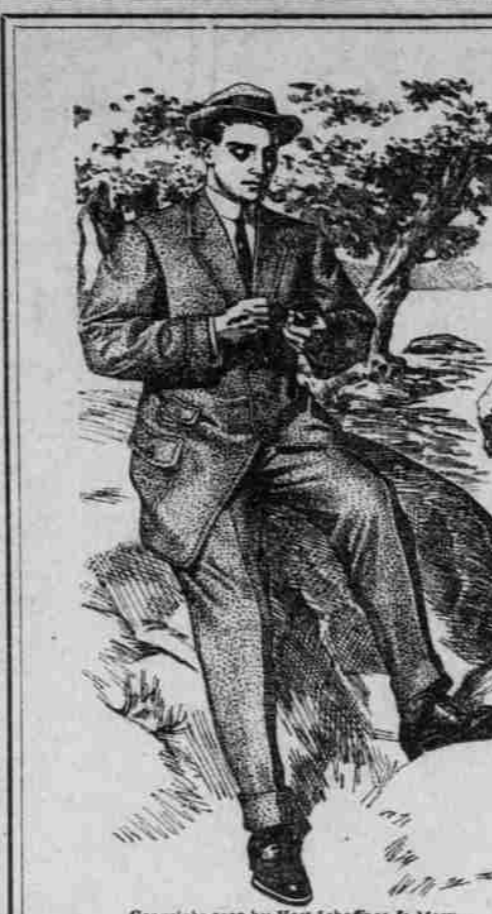
Copyright 1909 by Hart Schaffner & Marx

Acheson Cloak & Suit Co. 148 FIFTH STREET