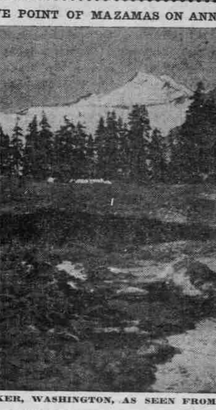
MOUNT BAKER, WASHINGTON, AS SEEN FROM SNOW LINE.

FOREST GROVE, Or., June 5.—(Special.)—Growing interest is being manifested in the four days' celebration to be given here from July 1 to July 5, inclusive, in commemoration of the National day.