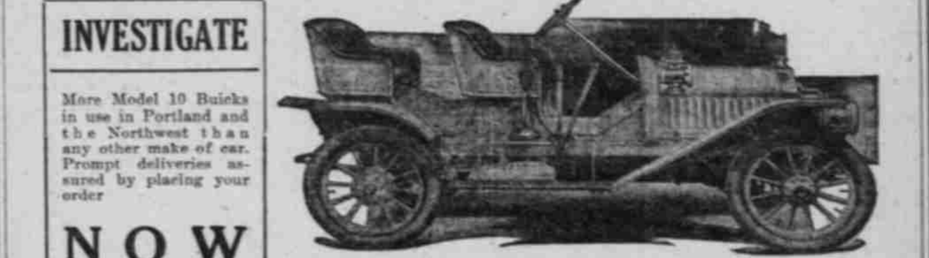
1909 MODEL 10 BUICK, $1050

Did you know that the Buick Model 17 holds the world's record for 100 miles on a circular track? Did you know that the Buick Model 17 holds the world's record for 100 miles straight away?