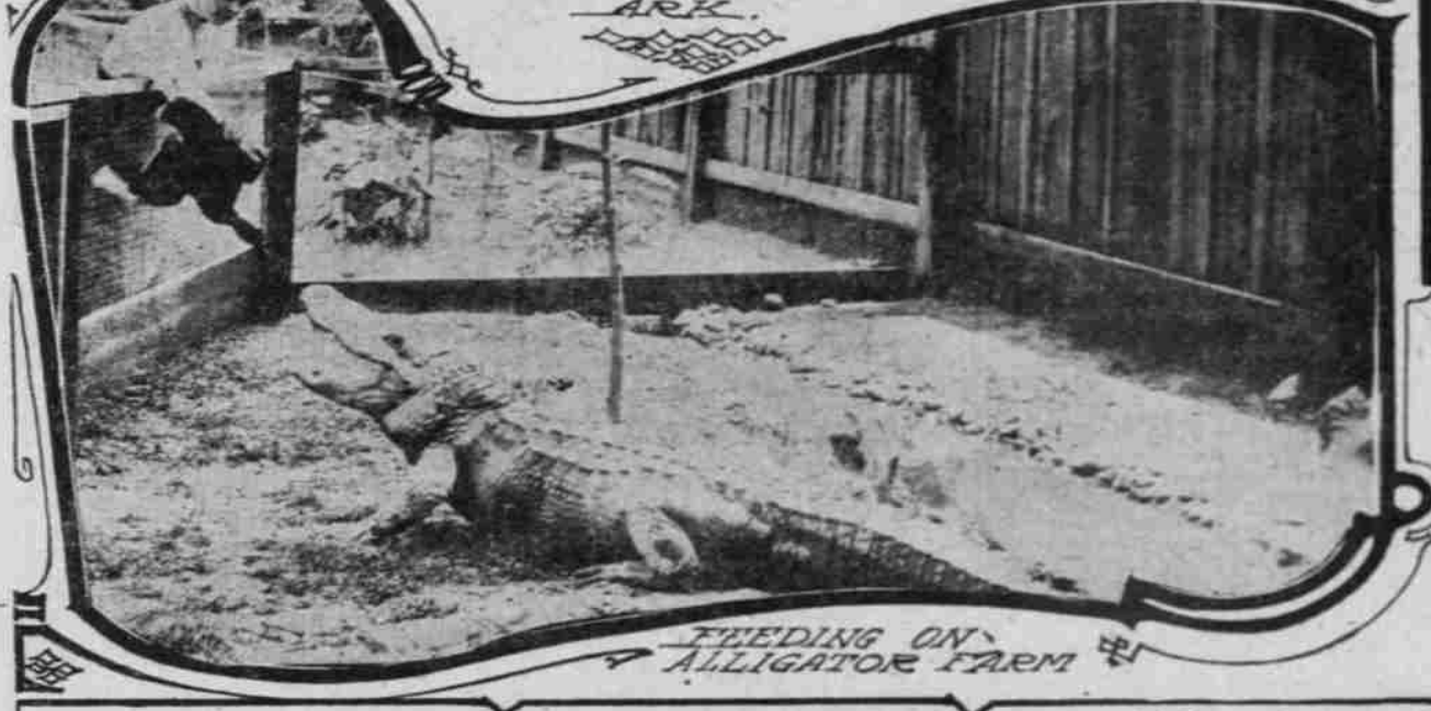
FEEDING ON ALLIGATOR FARM