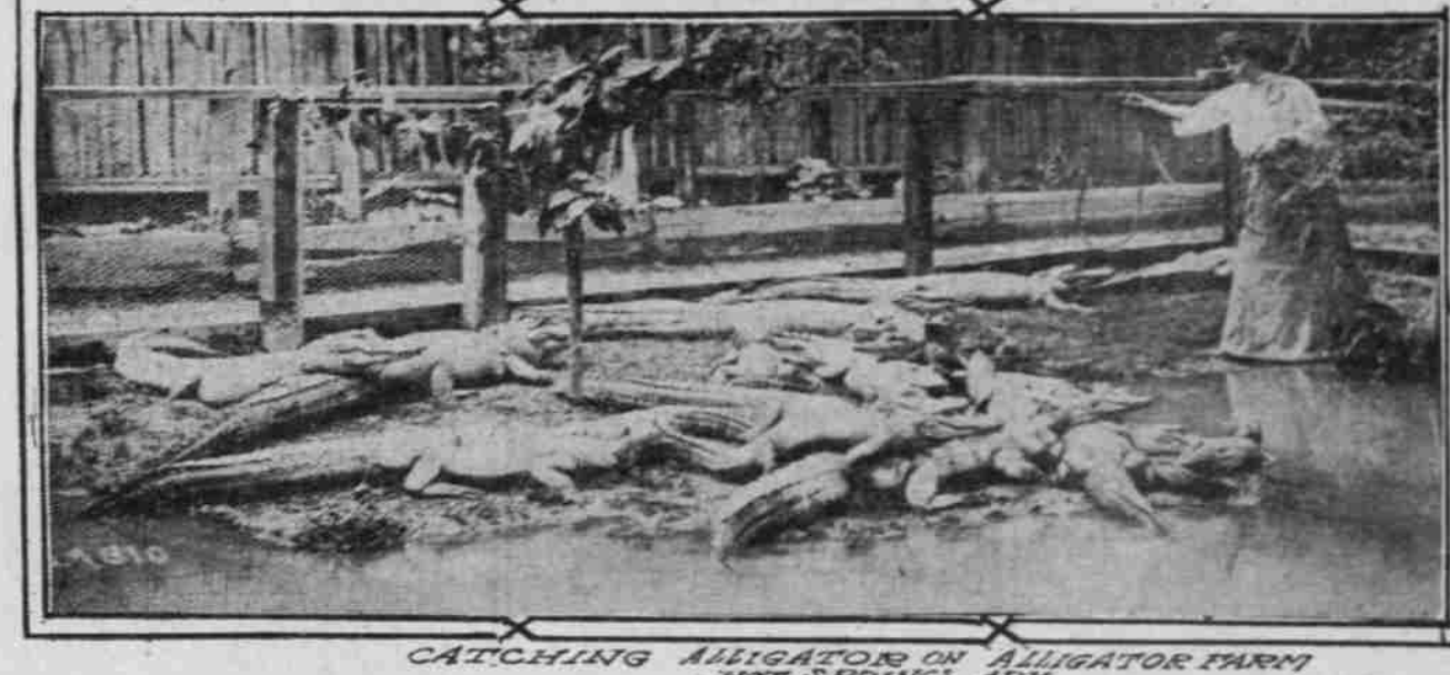
CATCHING ALLIGATOR ON ALLIGATOR FARM HOT SPRINGS ARK

NEW YORK, May 22.—(Special)—The Florida Legislature has put through one House and will probably put through the other a bill repealing the law to protect alligators. There has been an enormous slaughter of alligators in recent years and it had been found necessary to pass this law to protect the alligator, which is much used in the leather industry.