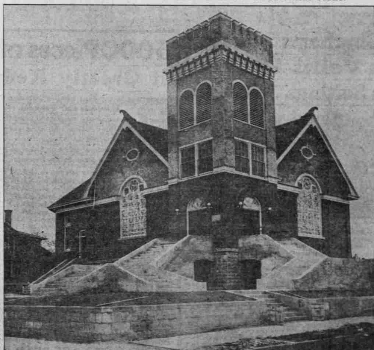
PILGRIM CONGREGATIONAL CHURCH, SHAVER STREET AND MISSOURI AVENUE, MULTNOMAH ADDITION.