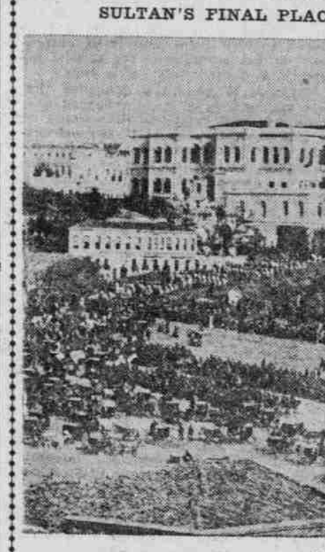
YILDIZ KIOSK, TURKISH ROYAL PALACE.