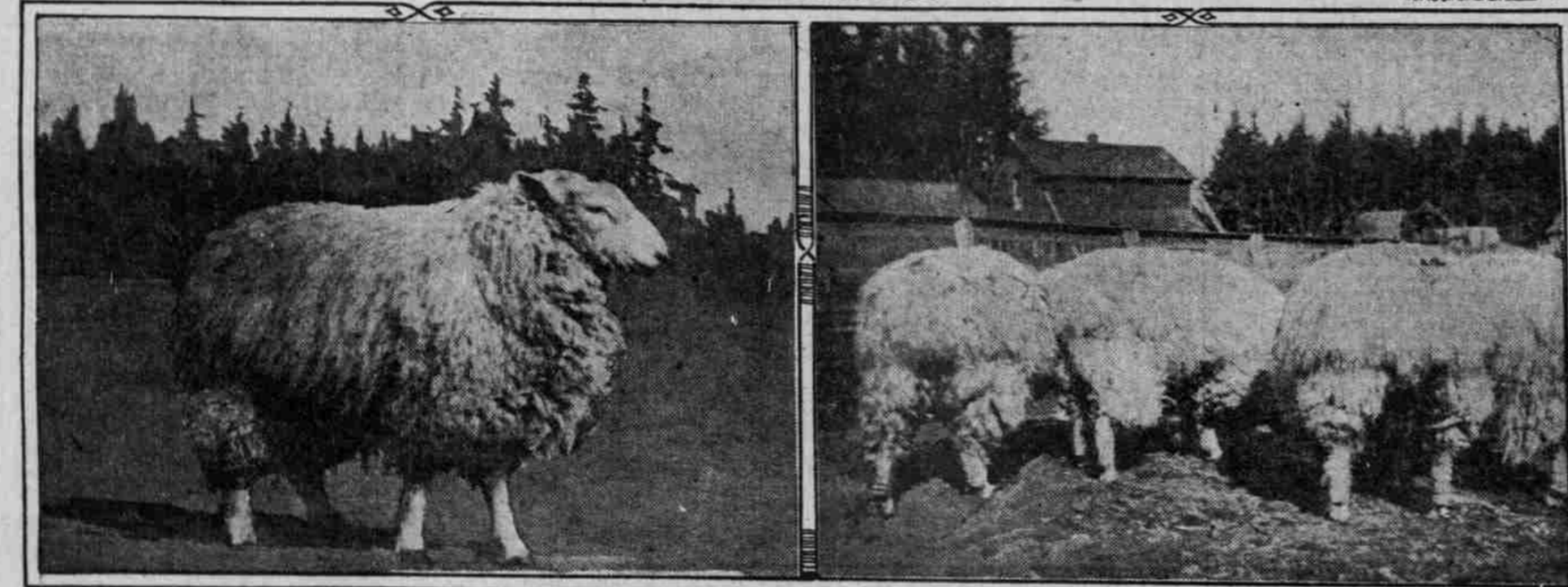
PRIZE YEARLING LINCOLN RAM