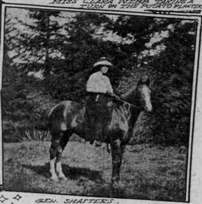
GEN. SHAFTERS' FAVORITE HORSE