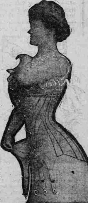
Nemo SELF-REDUCING No. 320

With all the graceful chic of the Boulevards, but with American excellence of workmanship. The acme of correct style. And there are other Nemo models for medium and slender forms, all with the well-known Nemo style and durability—a fit for every figure.