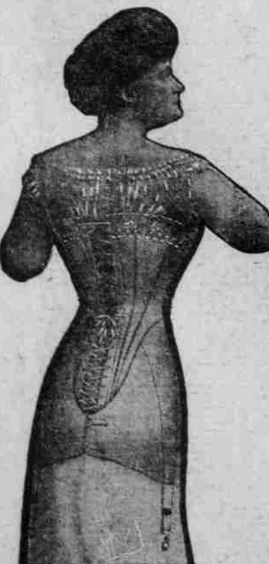
Nemo SELF-REDUCING No. 520

A distinct novelty, which is applied only to No. 404 and No. 405 (Self-Reducing). The RELIEF BANDS are an improvement over the famous Nemo Relief Straps. They are extra wide and strong, follow the convexity of the lower abdomen, and give perfect support from UNDERNEATH. Model No. 404, for very stout women, is made in sizes up to 42. It is the largest ready-made corset in the market.