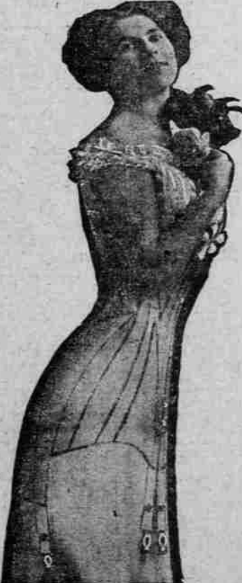
Nemo WILLOW-SHAPE No. 601

There is a Nemo Self-Reducing Corset to fit every type of stout figure. Our new No. 404, with Relief Bands, is made in sizes up to 42. Prices for Self-Reducing Corsets $3.50, $4.00, $5.00 and $10.00 There is no longer any reason why any stout woman should have her corsets made to order. Come this week and be fitted in a Nemo.