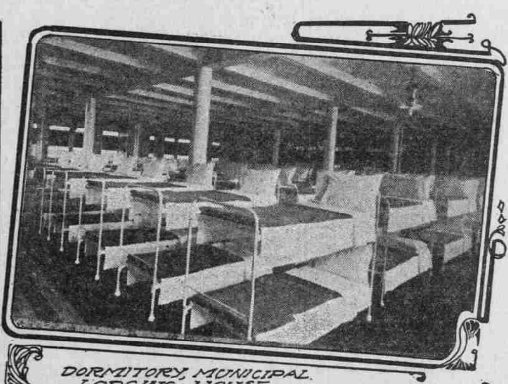
DORMITORY MUNICIPAL LODGING HOUSE