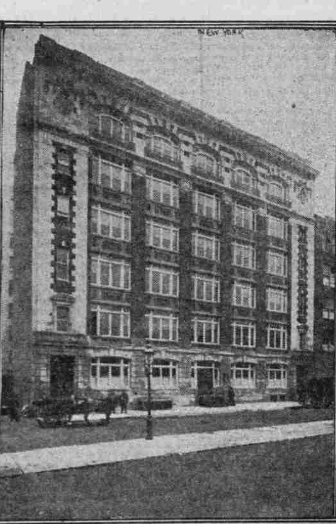
NEW MUNICIPAL LODGING HOUSE NEW YORK