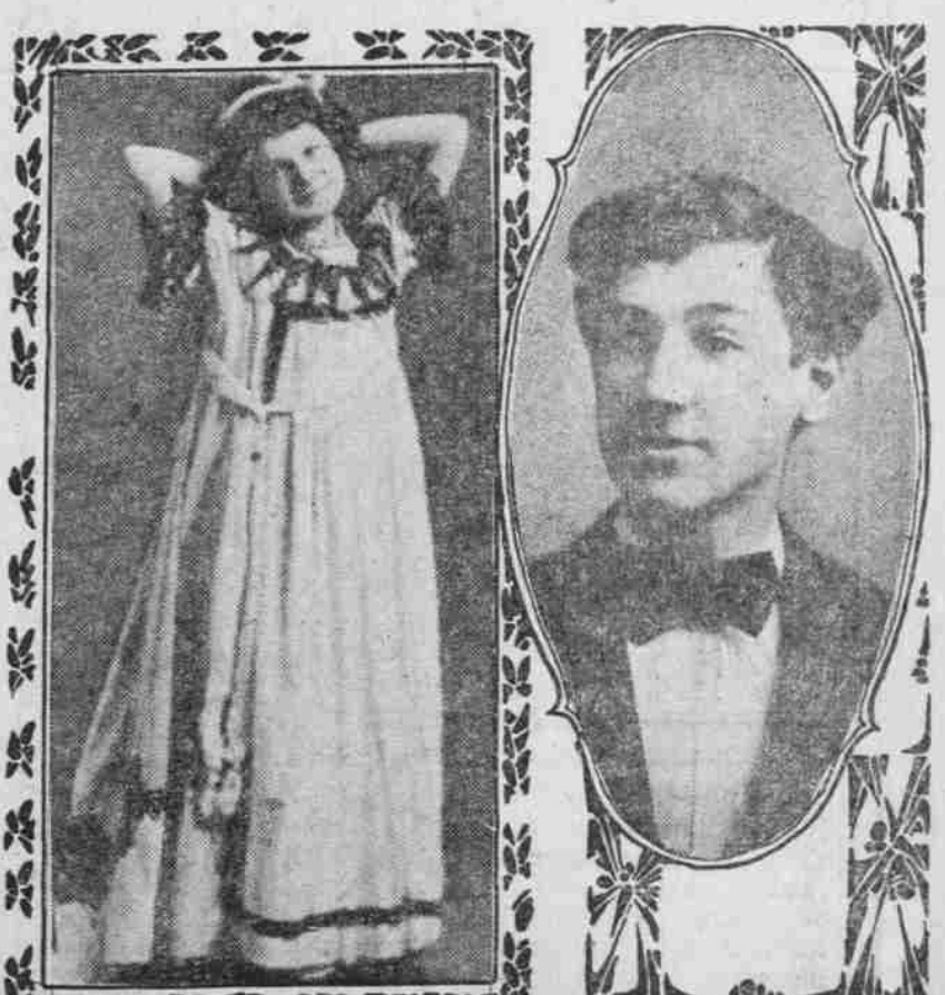
NOR STDROW BROTHERS

WILL TAKE PART IN CHRISTIAN BROTHERS' ENTERTAINMENT.