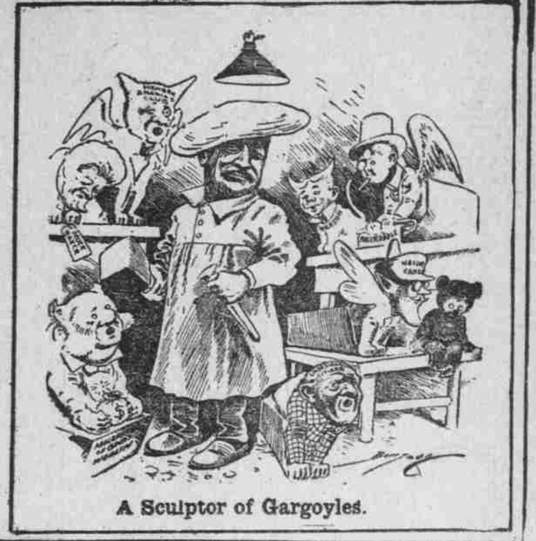
A Sculptor of Gargoyles.