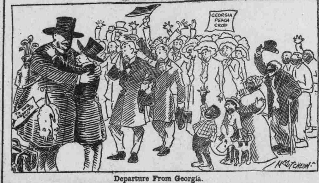
Departure From Georgia.