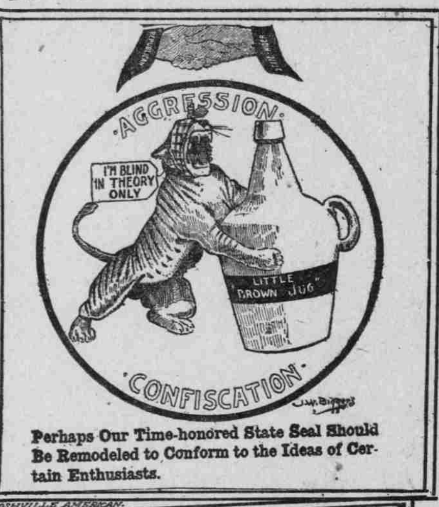
Perhaps Our Time-honored State Seal Should Be Remodeled to Conform to the Ideas of Certain Enthusiasts.