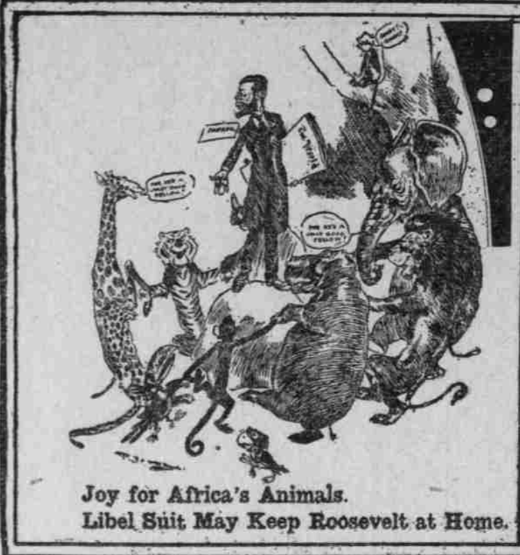
Joy for Africa's Animals. Libel Suit May Keep Roosevelt at Home.