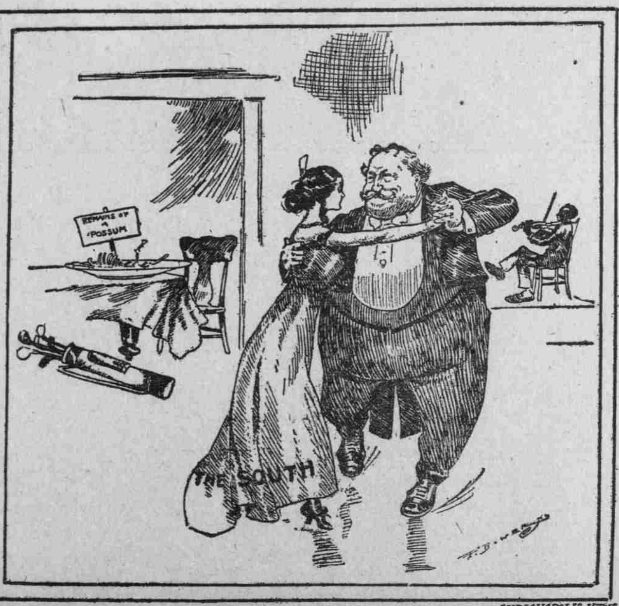
Winning the South.