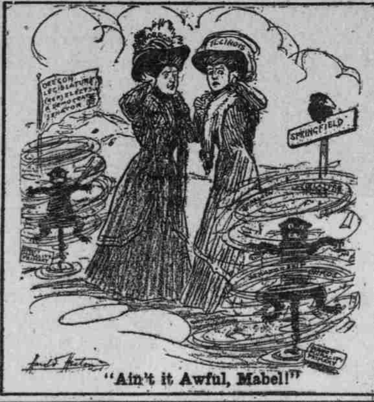
"Ain't it Awful, Mabel!"