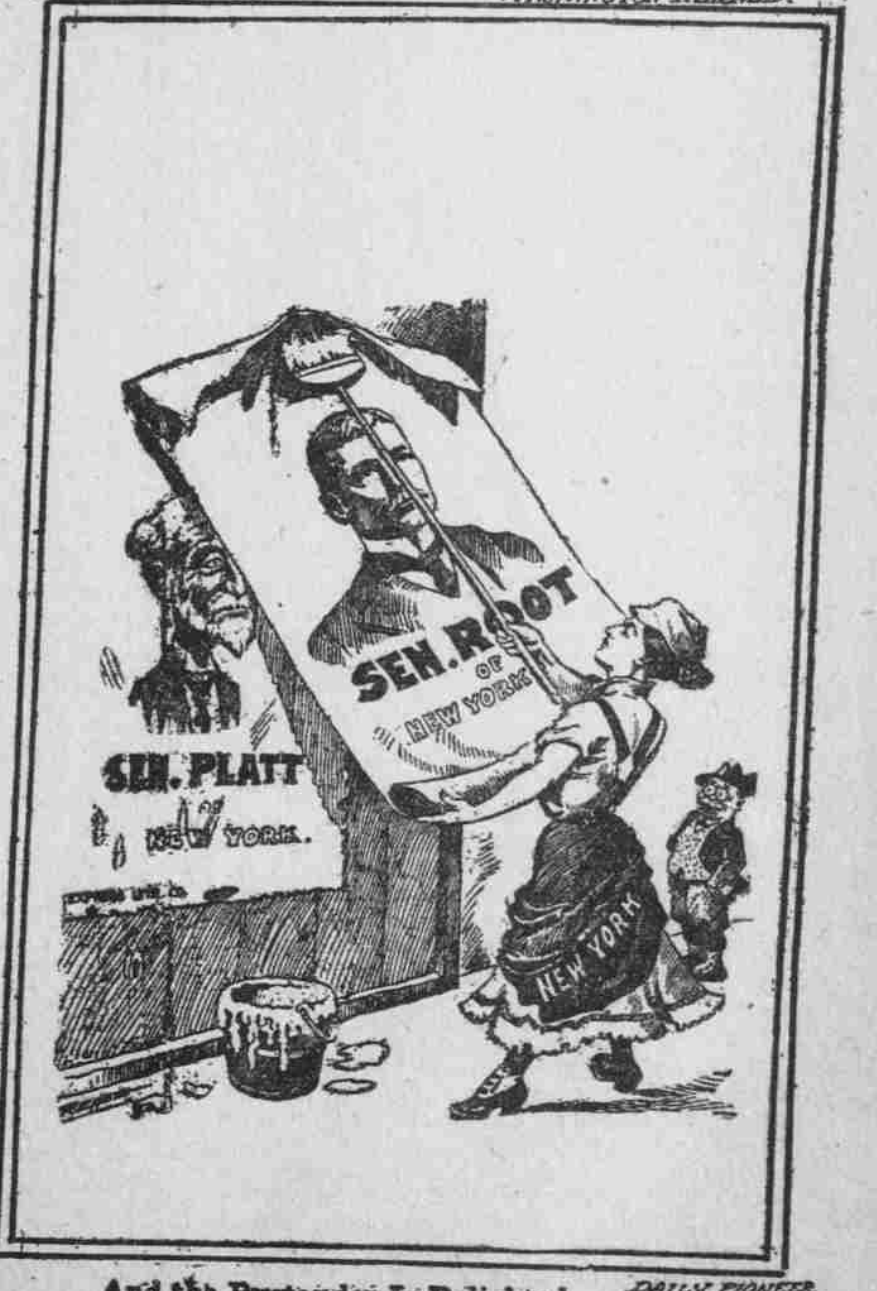
And the Bystander Is Delighted.