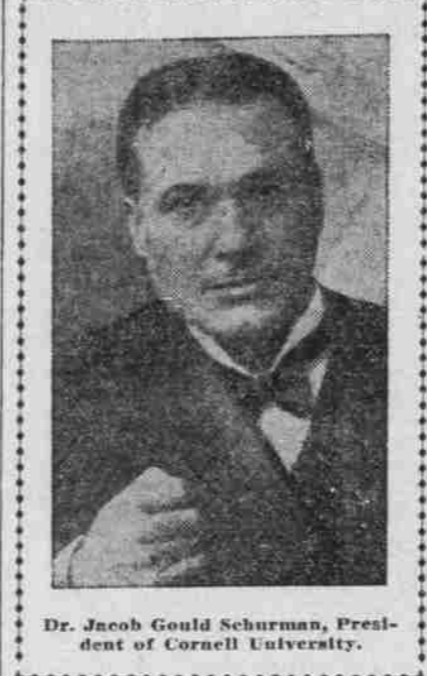
Dr. Jacob Gould Schurman, President of Cornell University.

Amendment of the Sherman anti-trust law to the extent that it shall apply only to monopolistic combinations is essential to the further industrial growth and pros- perity of the country, according to Dr. Jacob Gould Schurman, President of Cornell University, who is spending two days in Portland. Dr. Schurman reached Portland yesterday from San Francisco and leaves tonight for Puget Sound points. After attending the Washington