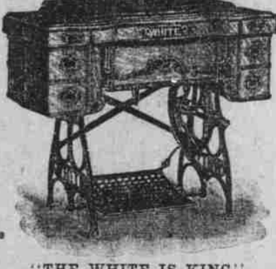
'THE WHITE IS KING'

These machines are to be given away to advertise. First—The fame of the late improved White Sewing Machine. Second—The White Sewing Machine is the most up-to-date, perfect machine on the market today, far in advance of any other. They sew easily, perfectly and swiftly any kind of goods with No. 36 to No. 200 thread without change of tension. There are 31 reasons why the late improved White is the finest machine in the world, and the price—$80.00 for style 35—is low, considering the quality, and it is the cheapest machine in the world to buy.