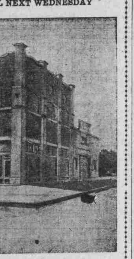
HOME OF ORIENT LODGE, I. O. O. F., EAST SIXTH AND EAST ALDER STREETS.

The handsome reinforced concrete building of the Orient Lodge, No. 17, I. O. O. F., on the corner of East Sixth and East Alder streets, has been completed, and the hall on the second floor is being elegantly furnished.