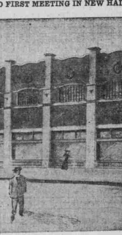
HOME OF ORIENT LODGE, I. O. O. F., EAST SIXTH AND EAST ALDER STREETS.

The handsome reinforced concrete building of the Orient Lodge, No. 17, I. O. O. F., on the corner of East Sixth and East Alder streets, has been completed, and the hall on the second floor is being elegantly furnished.