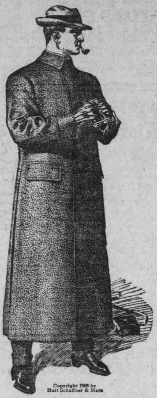
Copyright 1908 by Hart Schaffner & Marx

This store will be open every evening until Christmas.