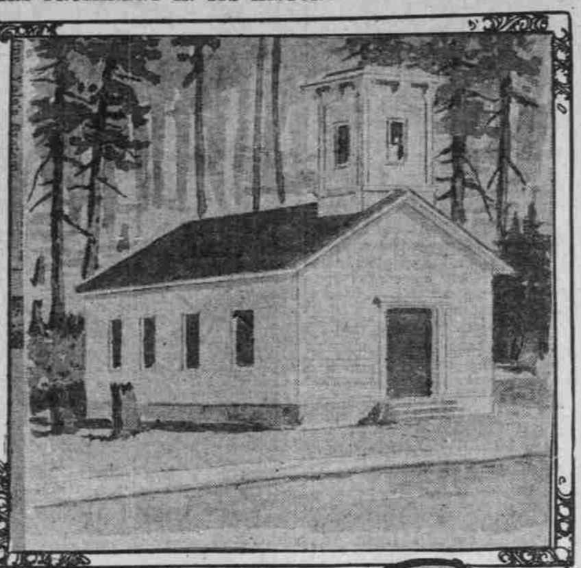
TAYLOR STREET CHURCH IN 1843