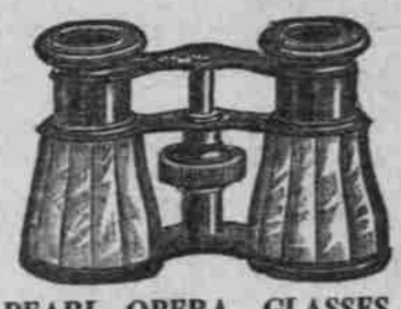
PEARL OPERA GLASSES $5.00, $7.50, $8.25

Every article purchased at our store is put in a box or package bearing the name "Jaeger Bros." When you make a Christmas gift you want to be sure its the real thing—you can't afford to have it otherwise.