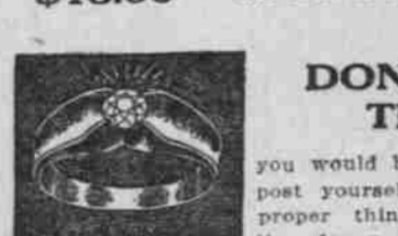
Gentlemen's Diamond $55.00

More Insurance Our attack is always new—not shopworn. This is how we do it. All jewelry, silverware, etc., must be sold at a profit within a certain period.