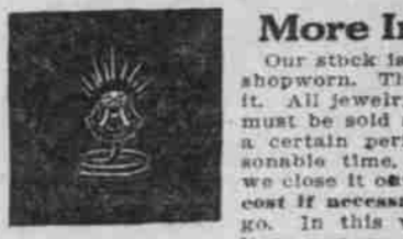
Genuine Diamond $15.00

Every article purchased at our store is put in a box or package bearing the name "Jaeger Bros." When you make a Christmas gift you want to be sure its the real thing—you can't afford to have it otherwise.