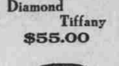
Diamond Tiffany $55.00

DON'T YOU THINK you would better come in and post yourself on what is the proper thing in the jewelry line for a Christmas present.