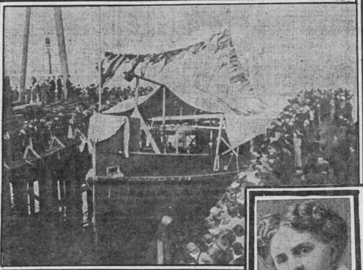
LAUNCHING OF THE H. B. KENNEDY