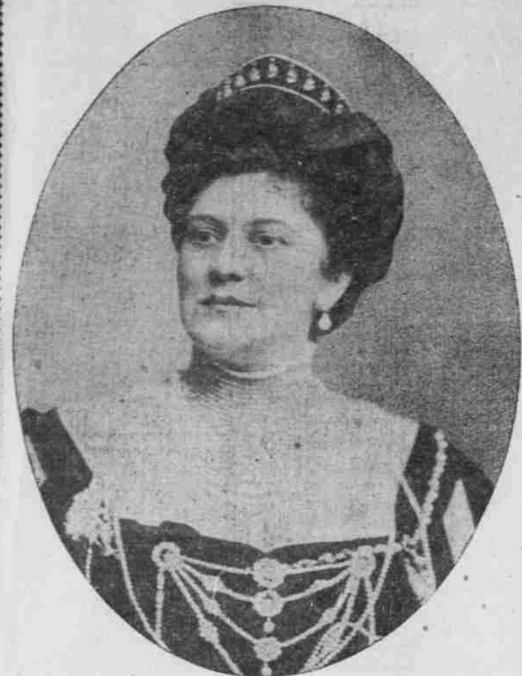
MME. LILLIAN NORDICA, WHO WILL SING IN PORTLAND, DECEMBER 10.

Great Songstress, Who Is Pet of Every Opera-House in Europe, Will Sing in Portland Under Direction Steers-Coman.