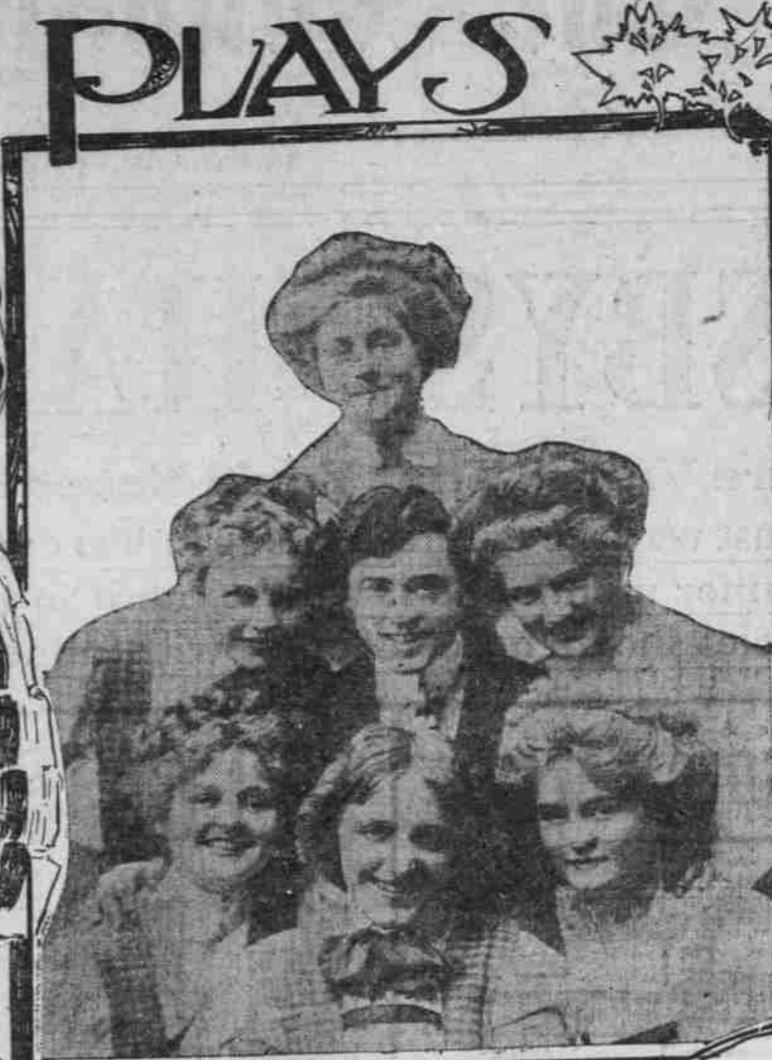
GUS EDWARDS' BLONDE TYPEWRITERS AT THE ORPHEUM

"Glittering Gloria" Next Week. "Glittering Gloria," which was announced some time ago at the Bungalow and postponed on account of failure of billboard advertising matter to arrive, will go on for the week following "Strongheart," opening with next Sunday's matinee. This is a sparkling brilliant comedy of unusual life and vivacity, and will be further embellished by the addition of several musical numbers.