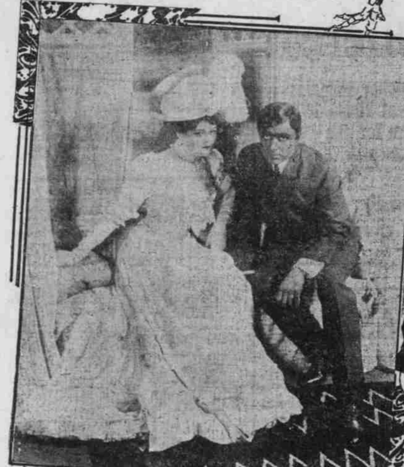
SCENE FROM "STRONGHEART" AT THE BUNGALOW