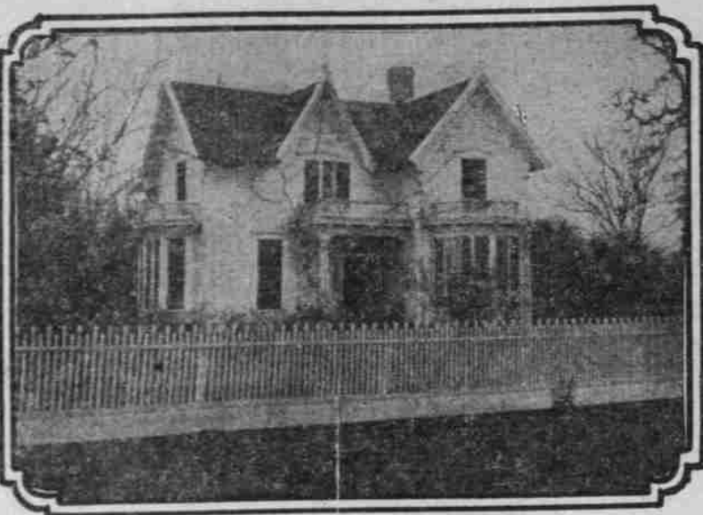
THE COUNTRY FOSTER HOME OF ONE OF THE AID SOCIETY GIRLS

Institution Which Takes Care of Homeless, Neglected and Abused Children Makes Appeal for Public Support.