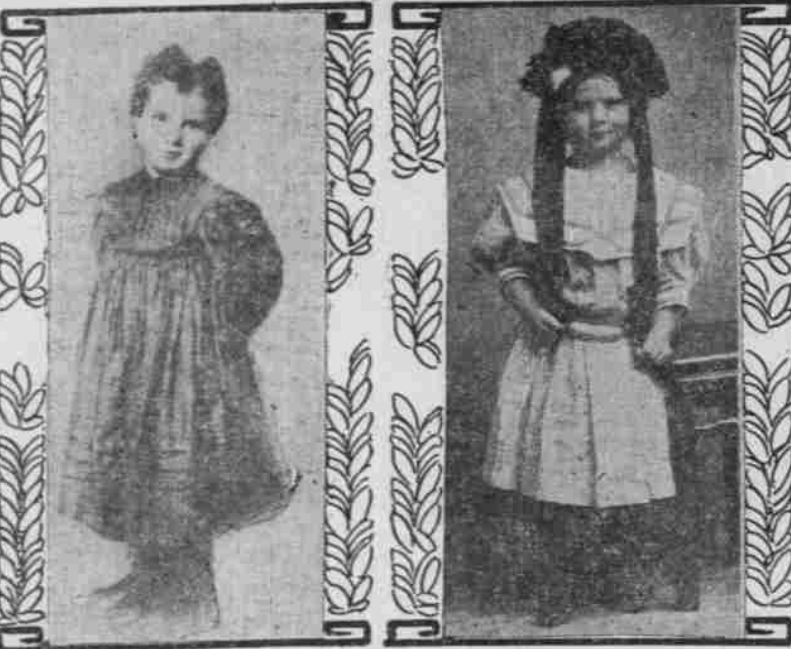
ONE OF THE LITTLE GIRLS WHO BEING PLACED AFTER BEING IN A FAMILY HOME THE SAME CHILD AFTER BEING IN A FAMILY HOME 1 1/2 YEARS

At this time of the year it is a time-worn custom for the charitable institutions of the city to appeal for support in the way of donations. Among these institutions is the Boys' & Girls' Aid Society of Oregon, the child-placing organization of the state.