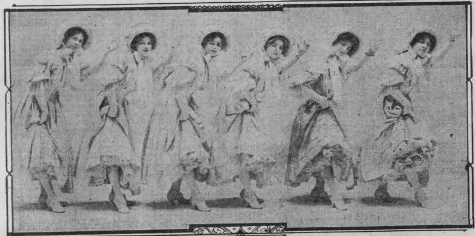
A GROUP OF PRETTY CHORUS GIRLS

Voting Contest to Determine Where Lies Greatest Honors in This Line Arouses Great Interest.