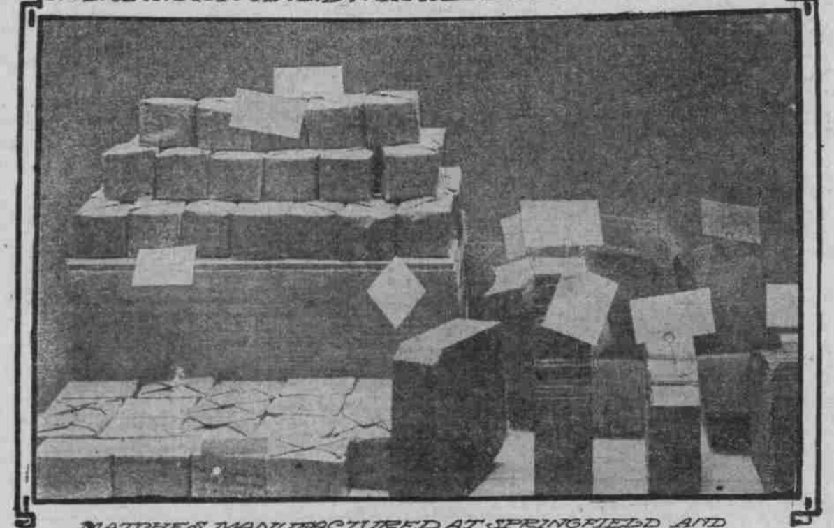
MATCHES MANUFACTURED AT SPRINGFIELD AND EXHIBITED AT THE INSTITUTE AND FAIR HELD BY THE GRANGERS AT SPRINGFIELD FRIDAY AND SATURDAY