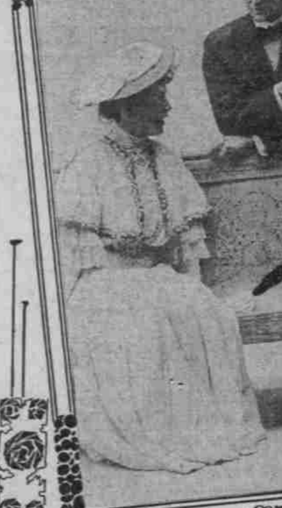
SCENE FROM GEORGE ADE'S MUSICAL PLAY "JUST OUT OF COLLEGE" AT THE BAKER