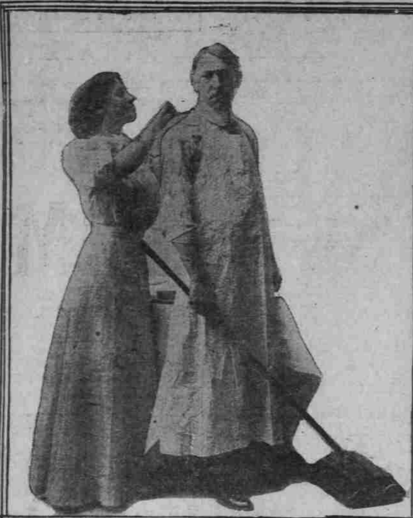
SCENE FROM "PAID IN FULL" AT THE HEILIG