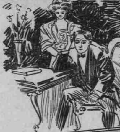
SCENE FROM "PAID IN FULL" AT THE HEILIG