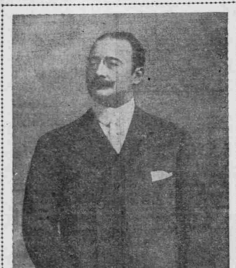
EMILIO DE GOGORZA.