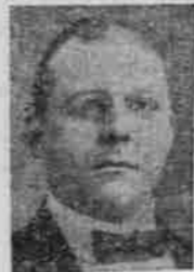
Eight years in Portland, 2 years in the leading colleges and hospitals of Europe.

Thompson has the most scientific eye-testing instruments in the optical field today.