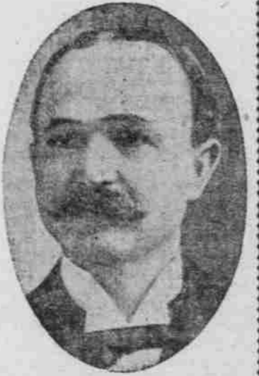
Hon. Will E. Humphrey.