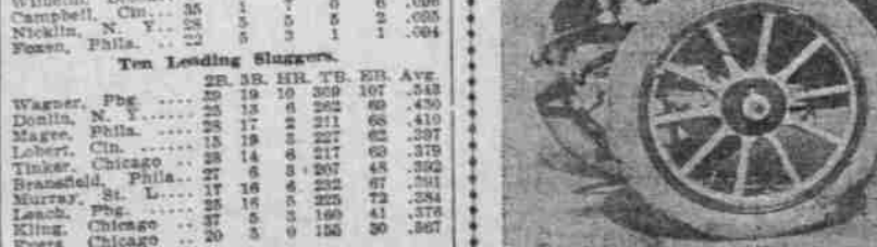
TYPE OF CAR THAT WON BRIGHTON BEACH RACE. The car shown in the above cut is of the same make and design as the racer entered in the last Brighton Beach 24-hour race, which Robertson drove at such a furious speed.