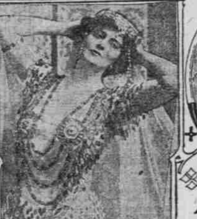
MISS MAXINE ELLIOTT