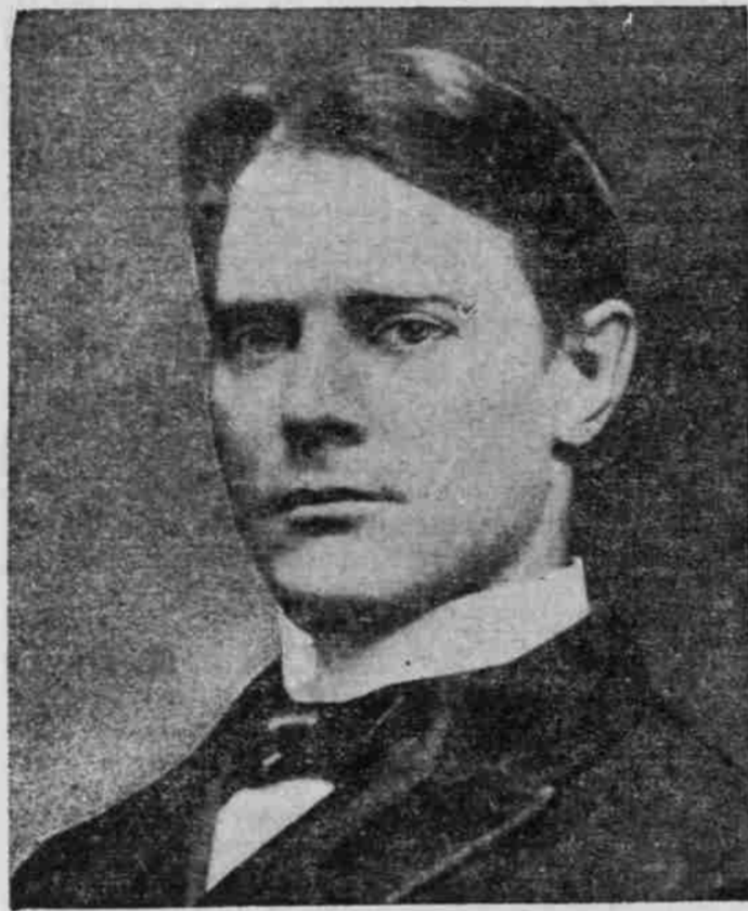
ALBERT J. BEVERIDGE, UNITED STATES SENATOR.

of output, according to allotment to each mill, are reported to have gone by the board, and now it is a case of every producer getting out for himself and selling as much and at whatever price he can obtain.