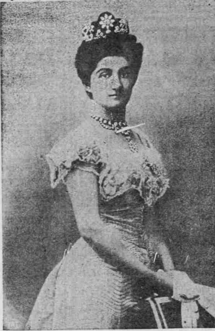
QUEEN HELENA, OF ITALY.

ROME, Oct. 3.—(Special)—Queen Helena of Italy is a real helpmate to her husband. She has recently taken lessons in bookbinding and has now so perfected herself that she is able to bind volumes of any size and in any sort of binding, including sheepskin. Accordingly King Victor Emmanuel has turned over to her a number of collections of state papers for the royal archives, which hitherto remained unbound because the king would not trust them to ordinary workmen. The queen is being paid for her work like an ordinary employe, but the money, of course, is devoted to one of her many charities. This also relieves the Italian government of a considerable sum. Heretofore bookbinders have been paid special rates to induce them not to divulge the contents of secret papers. The workmen have not always kept these secrets. The queen is a bookmaker as well as a bookbinder. She has written and published several volumes of poems dealing with Montenegro folklores.