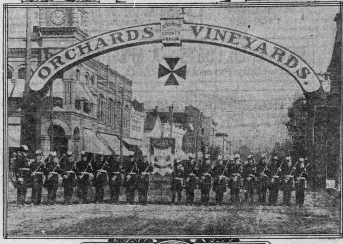
TEAM OF OREGON COMMANDERY NO. 1, KNIGHTS TEMPLARS, THAT WON THE BANNER PRIZE AT GRANTS PASS, FORMED FOR SERVICE