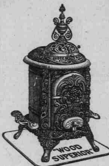
Wood's Superior Air-Tight Heater, 18 - inch.....$13.50 Wood's Superior Air-Tight Heater, 20 - inch.....$14.50 Wood's Superior Air-Tight Heater, 22 - inch.....$15.00 Wood's Superior Air-Tight Heater, 24 - inch.....$17.00

We are showing the greatest variety of heating stoves to be found in this city. Our stock consists of Coal Heaters, Wood Heaters, and a number of styles of Gas Heaters.