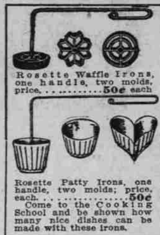
Rosette Waffle Irons, one handle, two molds, price, .....50c each Rosette Patty Irons, one handle, two molds, price, each, .....50c Come to the Cooking School and be shown how many nice dishes can be made with these irons.