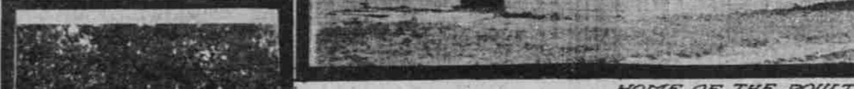
HOME OF THE POULTRY DEPARTMENT.