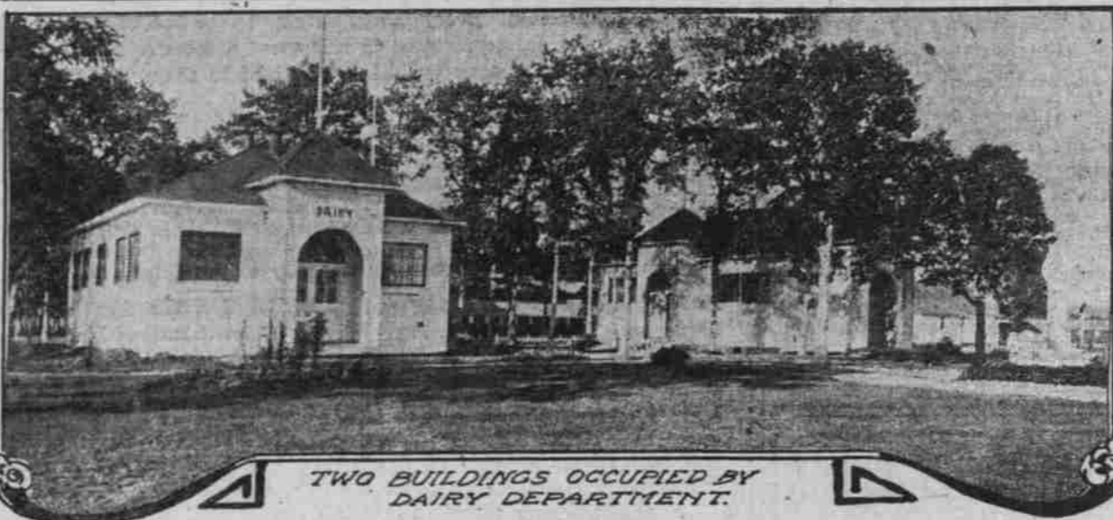
TWO BUILDINGS OCCUPIED BY DAIRY DEPARTMENT.