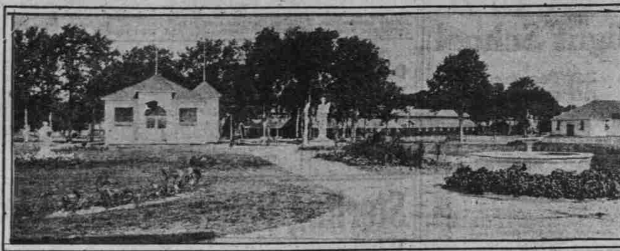
VIEW OF STATE FAIR GROUNDS FROM PAVILION