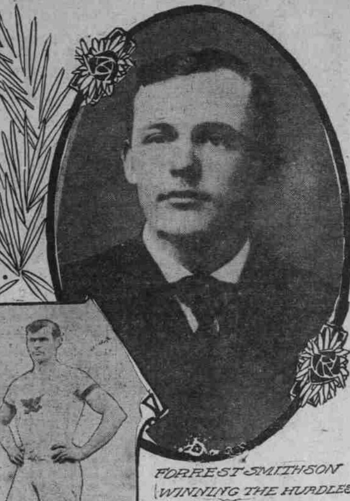
FORREST SMITHSON WINNING THE HURDLES