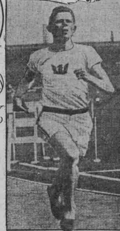
MELVIN W. SHEPPARD 1500 & 800 METER