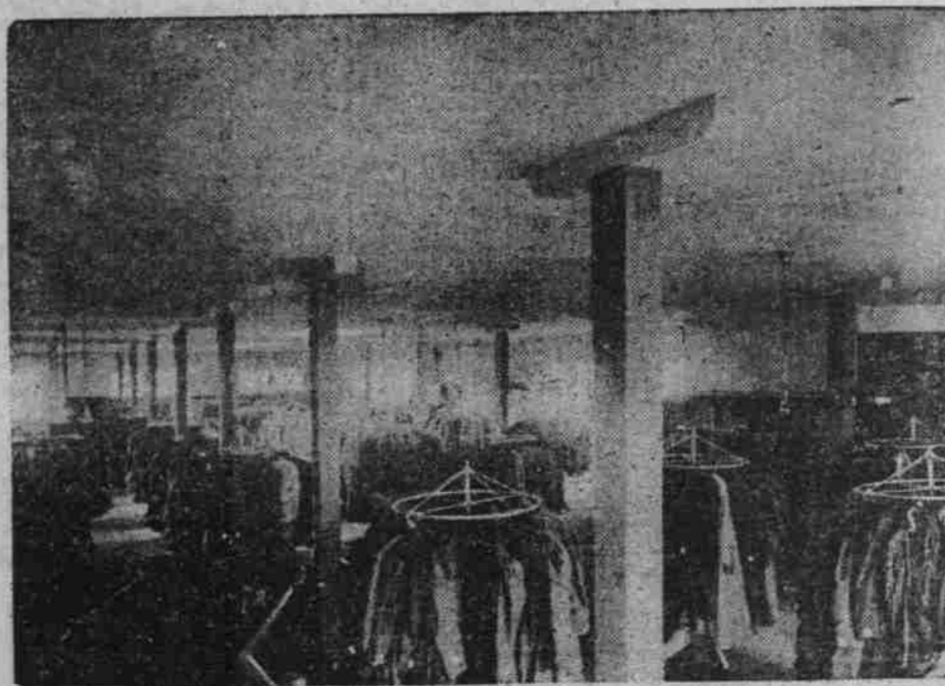
Interior View of Coat and Suit Floor, 5000 Square Feet.