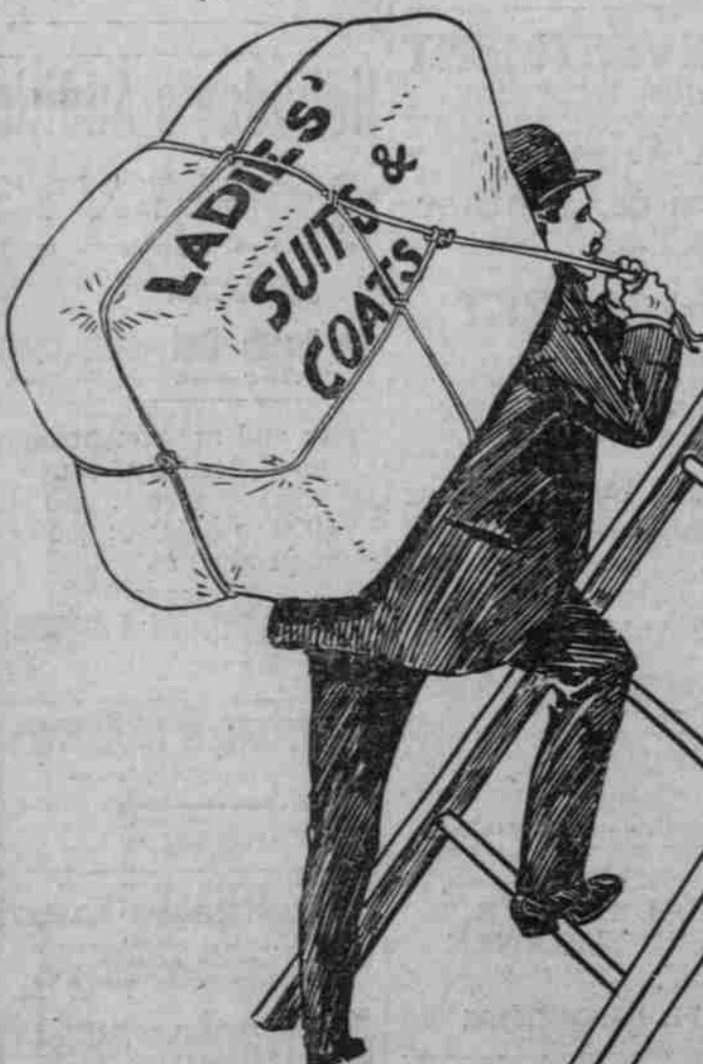
I'm Starting Up—Can't You Give Me a Lift?

Acheson Building, 148 and 150 Fifth Street