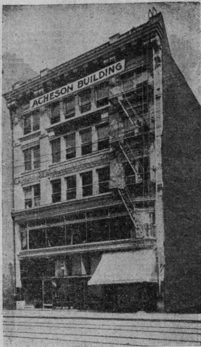
We Are Located in the Acheson Building, Two Floors, 148 and 150 Fifth St.

We have no room here in this announcement or opening ad. to itemize, but say, notice our expense account for running this big garment store—the largest garment floor in Portland—$1.50—one dollar and fifty cents a day rent. It ain't worth mentioning, is it? Do you think such an expense will affect retail prices? Wouldn't think a fellow an idiot to have such a low expense and yet ask high rent and expense-eating prices for his goods? Well, we are going to take advantage of the opportunity to sell at low prices, and we will make some money—don't forget that—and you will save about one-fourth to one-third if you buy of us. Prices quoted to you are, and will be, very low, simply because we can afford to do so—nothing else. They will be so reasonable that they will be very noticeable to you. But let us remind you that trashy goods will not be found in this store. It makes a man sick to buy trash in New York. It will make anyone sicker to sell it. Hence you can depend on the goods, as well as the prices of our garments.