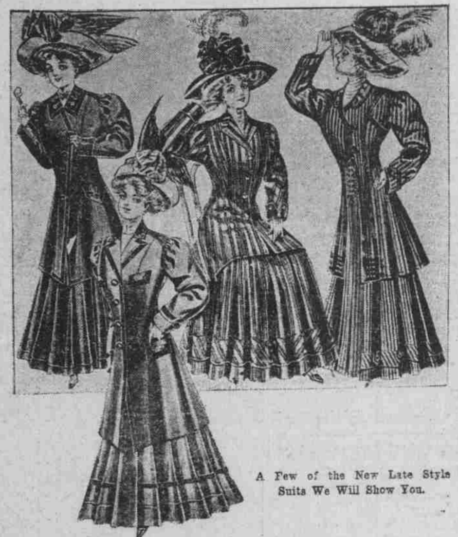
A Few of the New Late Style Suits We Will Show You.

We have no room here in this announcement or opening ad. to itemize, but say, notice our expense account for running this big garment store—the largest garment floor in Portland—$1.50—one dollar and fifty cents a day rent. It ain't worth mentioning, is it? Do you think such an expense will affect retail prices? Wouldn't think a fellow an idiot to have such a low expense and yet ask high rent and expense-eating prices for his goods? Well, we are going to take advantage of the opportunity to sell at low prices, and we will make some money—don't forget that—and you will save about one-fourth to one-third if you buy of us. Prices quoted to you are, and will be, very low, simply because we can afford to do so—nothing else. They will be so reasonable that they will be very noticeable to you. But let us remind you that trashy goods will not be found in this store. It makes a man sick to buy trash in New York. It will make anyone sicker to sell it. Hence you can depend on the goods, as well as the prices of our garments.