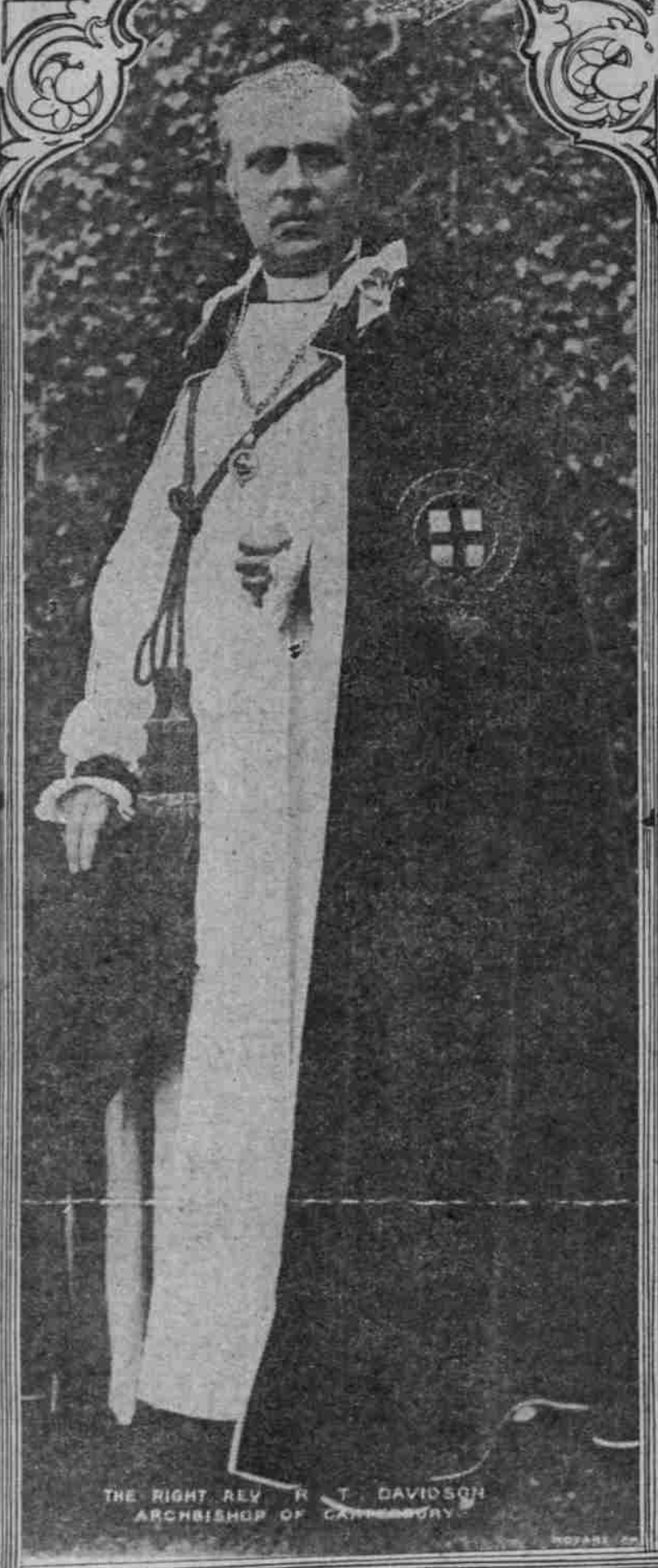
THE RIGHT REV. R. T. DAVIDSON, ARCHBISHOP OF CANTEBURY