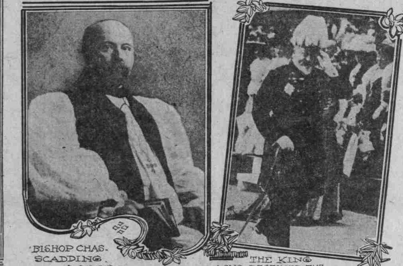
BISHOP CHAS. SCADDING