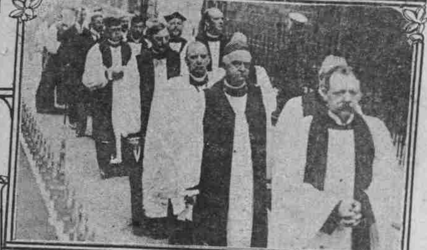
AMERICAN BISHOPS BISHOPS OF OREGON, UTAH, SOUTH DAKOTA AND SPRINGFIELD

confine his speech to educational and religious problems, saying that "the races which can assimilate other races and help them forward are those which prosper, and the races which cannot are those which are on the decline." That truth applied perhaps more fully to the United States and to the Anglo-Saxon race all over the world than it did to any other. We saw a marvelous power of assimilation on the part of the Anglo-Saxon race in an extraordinary degree in the United States of America. There we found men of every race coming to take up their abode, and somehow or other drawn into one nationality, assimilated by those who carried the government of that country and formed the nucleus of the population.