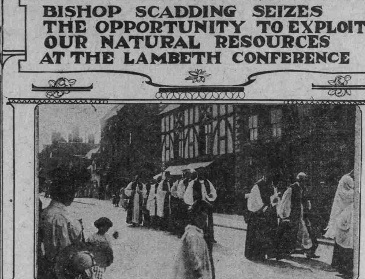
END OF MISSIONARY PROCESSION IN STREET OF ROCHESTER