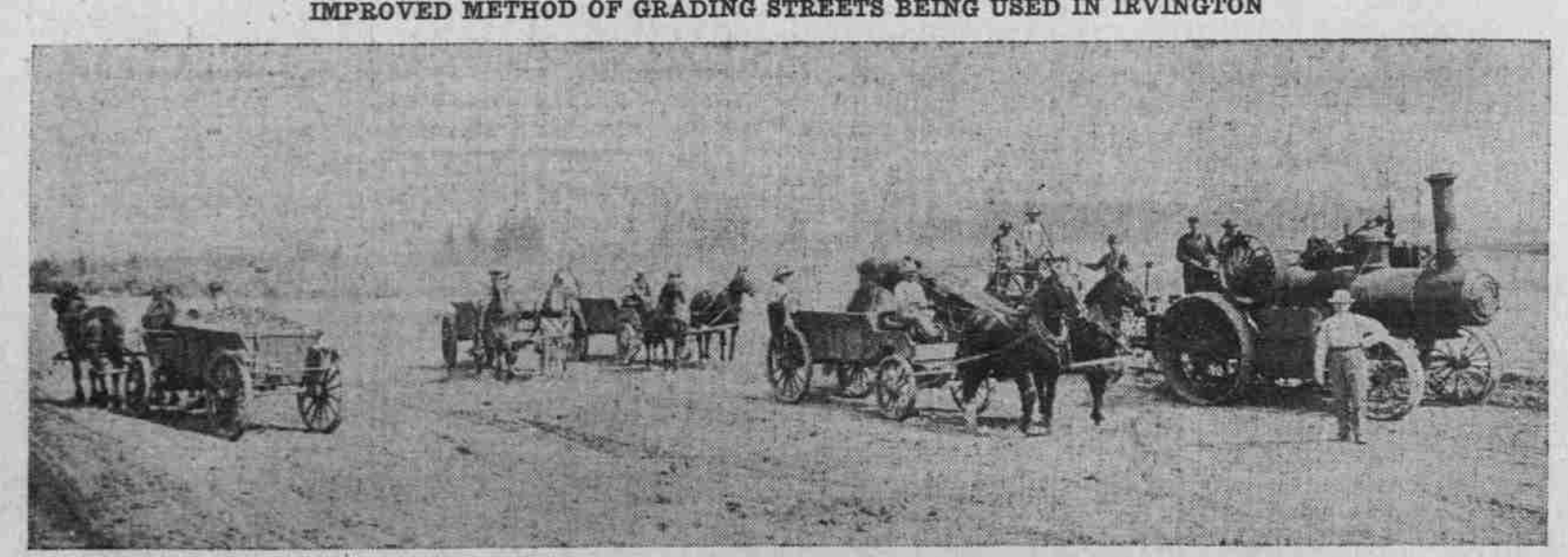
The accompanying illustration shows how Elwood Wiles is improving and grading the streets in what was known as the old Irvington race. This grading outfit is the most improved and up-to-date in the city.

The Campmeeting Association bought eight acres at this point for $200 an acre, and recently sold off three acres on the preliminary work of construction of a Flat."