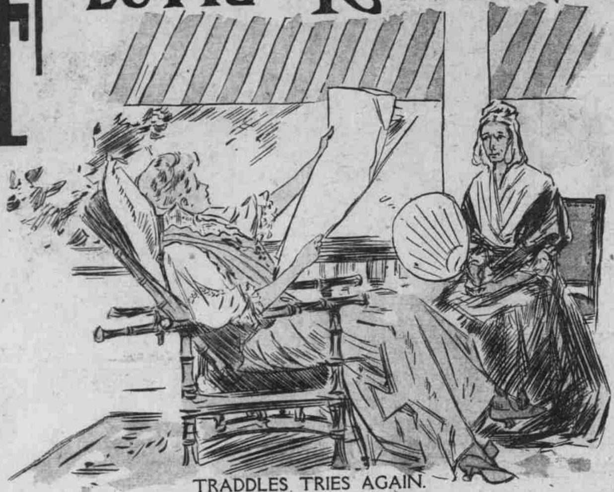
TRADDLES TRIES AGAIN.

"Of all the men that I have met," said Fluffy's maiden aunt, Joe Traddles is the human-est. He's awkward, that I grant, But if you gave him half a chance to show what he could do I'm sure he'd risk both life and limb to prove his love for you." Said Fluffy Ruffles with a pout, "Of all the men I've struck That poor Joe Traddles seems to have the very meanest luck, And if I were to marry him and be his faithful wife Ill luck would hit us every day throughout our married life."