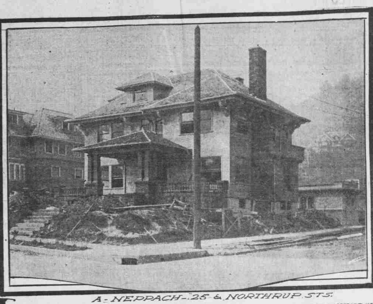
A. NEPPACH, 25 & NORTHrup STS.