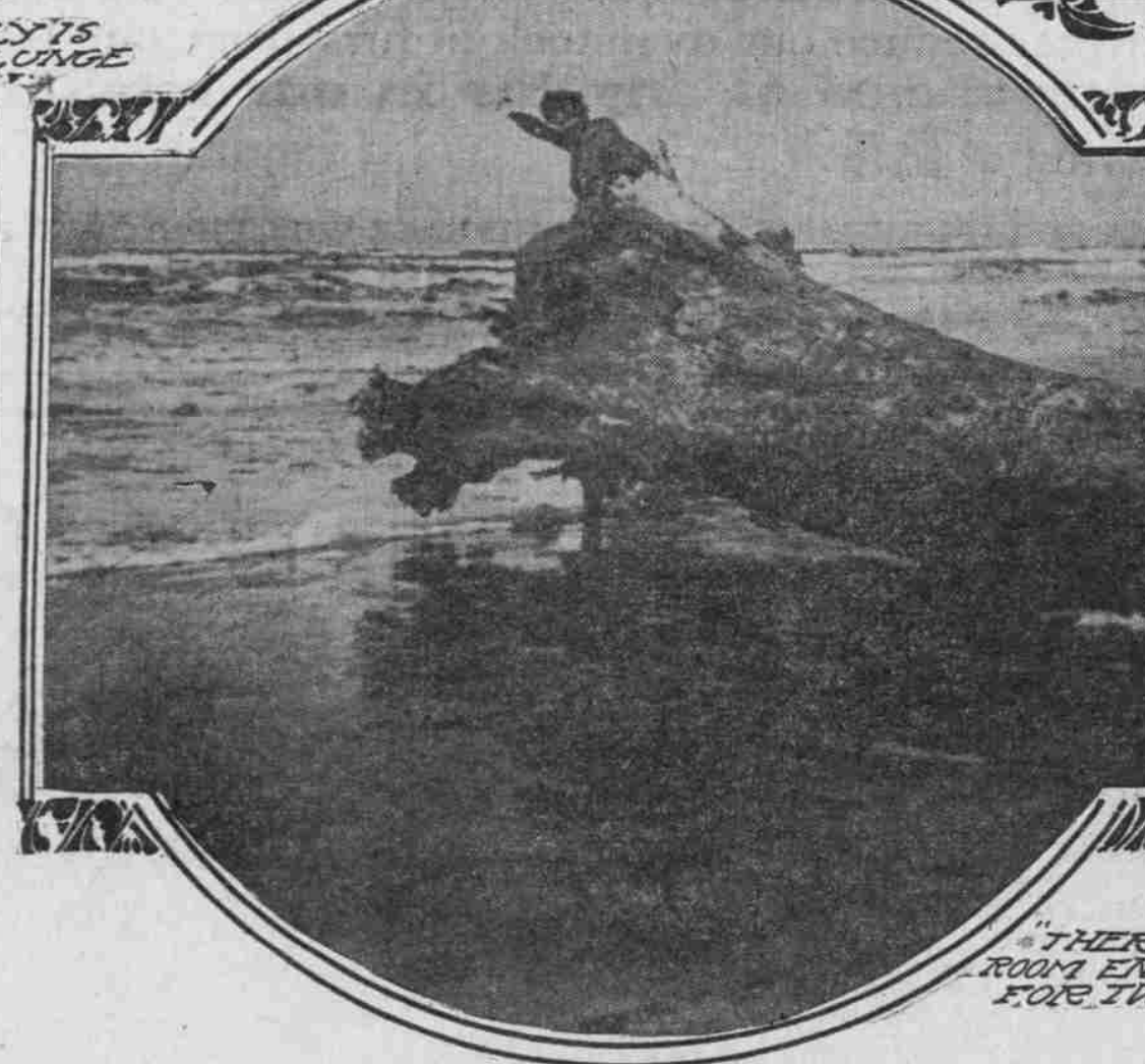
THERE'S ROOM ENOUGH FOR TWO