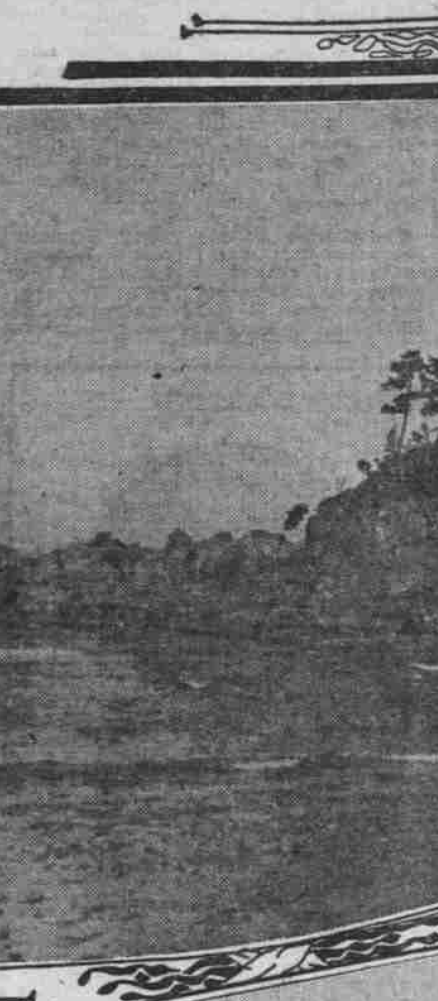
TAKING BABY FOR A DIP