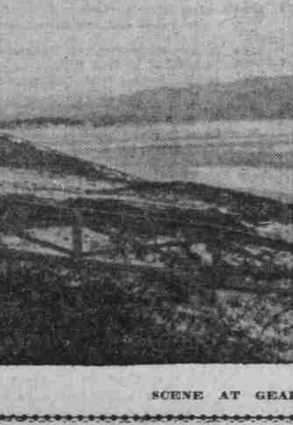
SCENE AT GEARHART PARK.