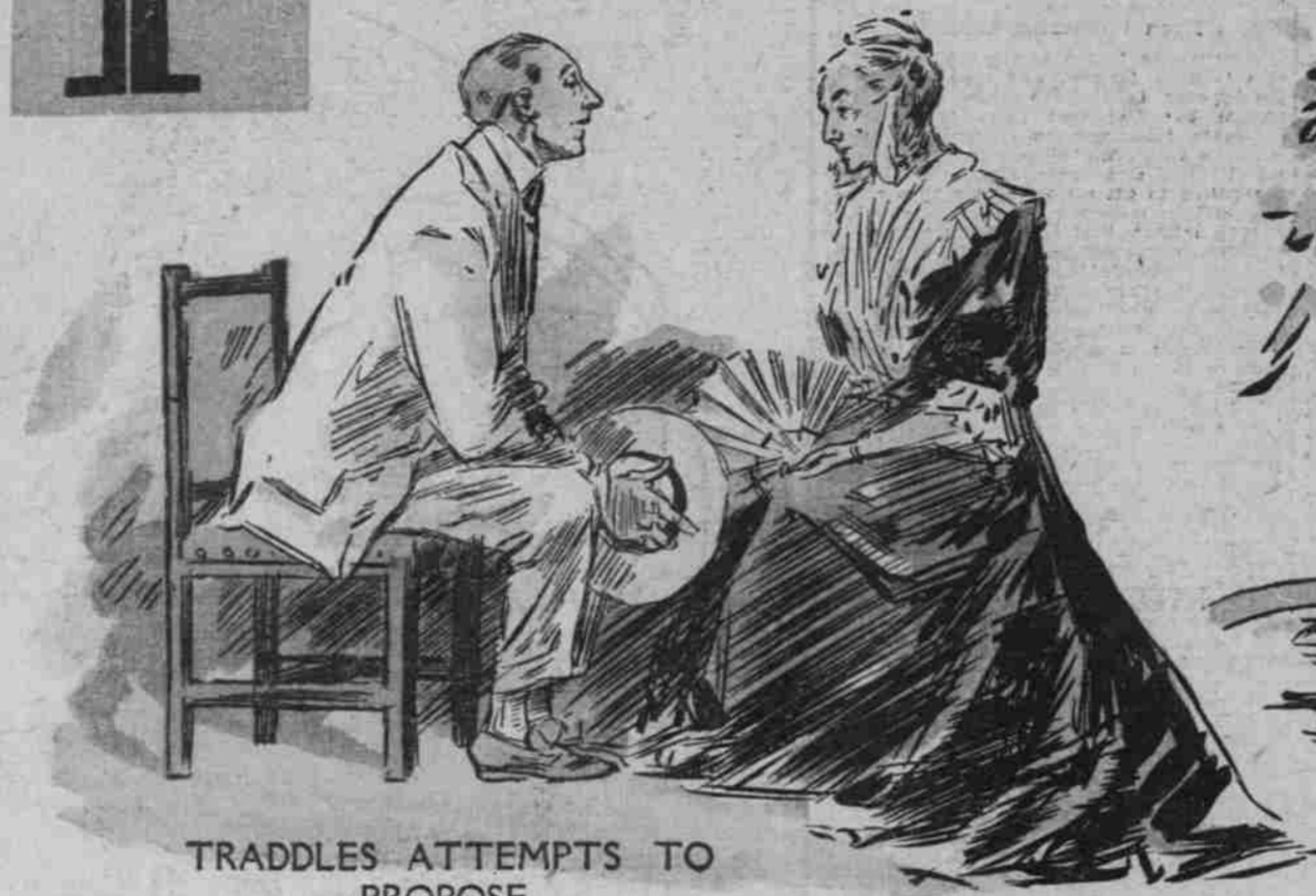
TRADDLES ATTEMPTS TO PROPOSE.

1.—Aunt Mary liked Joe Traddles, he was such a "wholesome boy." She knew the arts defensive that good women oft employ, And when dear Fluffy sent him word that she was "fast asleep," For fear that she'd accept him, why, it made Aunt Mary weep. So when she met Joe Traddles next she said "You have a chance Of winning pretty Fluffy's hand." "God bless ALL maiden aunts!" Said Traddles as he wrung her hand, "I'll call on her to-morrow And till she says 'I really can't' I will not borrow sorrow."